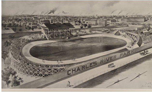
Charles River Park on Mass Ave 134 (circa 1896)

Cycling development in Cambridge: The sport of cycling gained popularity shortly after the Civil War. An indoor velocipede rink opened in Central Square in 1869, and by the early 1870s neighborhood cycle clubs were advertising excursions to outlying towns. Charles River Park, a stadium constructed expressly for bicycle racing was built on a ten-acre site on Massachusetts Avenue at Landsdowne Street in 1896 and operated at least through 1902. Bicycling maintained its popularity until the introduction of automobiles; unfortunately, most of the local cycling clubs disappeared by the time of World War I. It would take another 70 years before we would see the first Rail to Trail conversion in Cambridge.