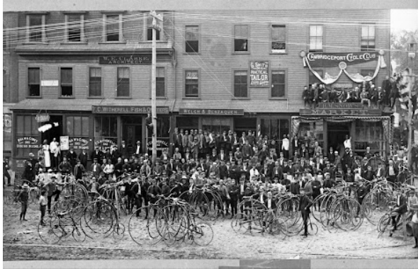
Cambridge Port Cycle Club (1890s)

Both bicycles and trains go back to the early 19th century, have spread around the globe, and have vastly evolved since then. Trains have a rich history in Cambridge and while we continue to rely on them and even build new routes (such as the Green Line extension), some older routes have been abandoned or no longer need as much space. This has provided some great opportunities to build multi-use paths across the city to connect Cambridge with neighboring towns. Some have been around for some time, some were just opened to the public, and some are about to begin their transformation.