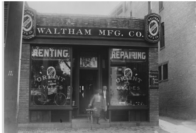
Bicycle Shop on Mass Ave 424 (1899)

Cycling development in Cambridge: The sport of cycling gained popularity shortly after the Civil War. An indoor velocipede rink opened in Central Square in 1869, and by the early 1870s neighborhood cycle clubs were advertising excursions to outlying towns. Charles River Park, a stadium constructed expressly for bicycle racing was built on a ten-acre site on Massachusetts Avenue at Landsdowne Street in 1896 and operated at least through 1902. Bicycling maintained its popularity until the introduction of automobiles; unfortunately, most of the local cycling clubs disappeared by the time of World War I. It would take another 70 years before we would see the first Rail to Trail conversion in Cambridge.