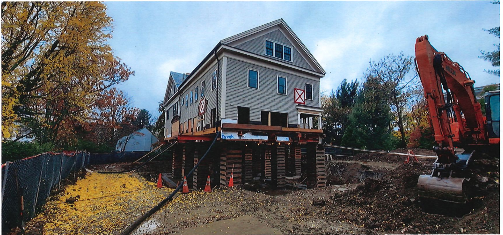
02 - Existing Framing Conditions