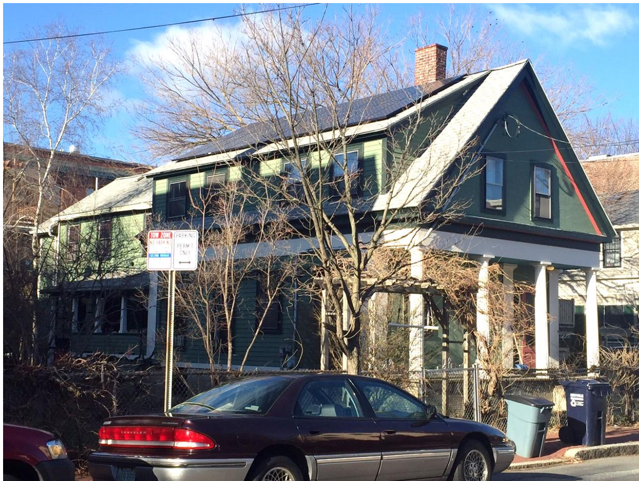
40 Cottage Street, 2016