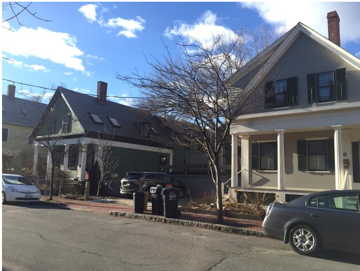
40 Cottage Street (left) and 44 Cottage Street (right), CHC staff photo, 2016