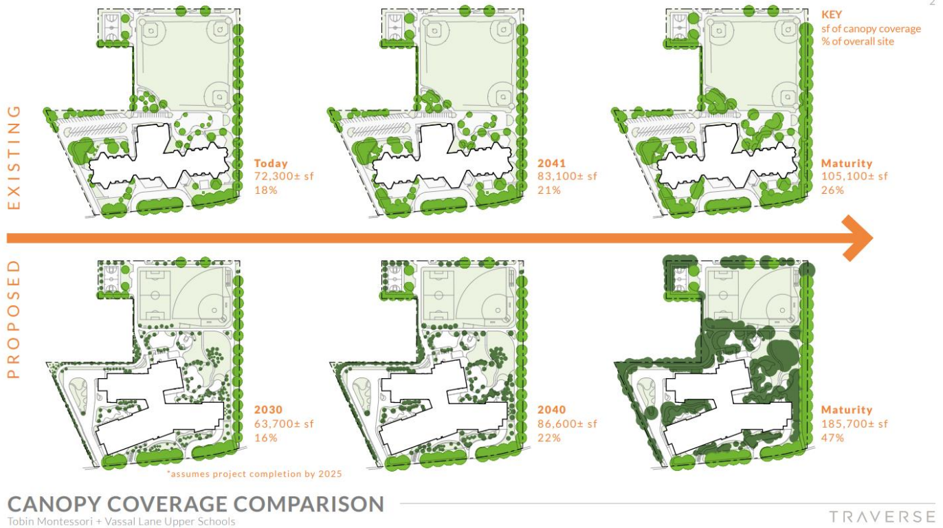
Figure 4: Canopy Coverage over time.

Finally, over time the expectation is that, given the additional plantings that are proposed together with the additional care associated with the new trees, the canopy associated with the proposed planting will significantly exceed the canopy coverage previously provided by the old canopy (18%). It is estimated that within 5 years of the project completion i.e., 2030 the new canopy will be within 12% of the size of the existing canopy and that by 2040 the new canopy is projected to be approximately 3,000 square feet larger than the existing canopy would have been at that same time. Finally, at maturity it is expected that the project area will have a canopy coverage of 47% of the entire site, which is approximately 77% greater than the anticipated canopy coverage for the old canopy (26%) at maturity.