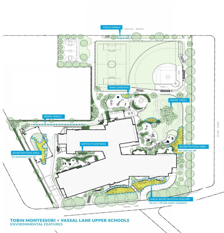
Figure 3: The proposed Landscape plan

Highlighting and engaging environmental sustainability is a vital component to the proposed design. The large palette of native plant types will introduce biodiversity to the site with little need for supplemental water. Working together with topography, plants will capture, hold, and filter stormwater from new roof areas, neighboring streets, and on-site hardscape areas via a network of large bioretention basins, small rain gardens, and grassed swales. A portion of this water will be directed to a subsurface holding tank to be reused as a source of water to irrigate the recreation fields. The environmental features have been thoughtfully integrated into the play and gathering spaces on-site to promote engagement and interaction from the students and community members who use them. Educational signage will be placed throughout the site to assist in the educational qualities of these features, allowing the community to better understand the environmental and sustainable benefits of the proposed site as well its history and past land uses.