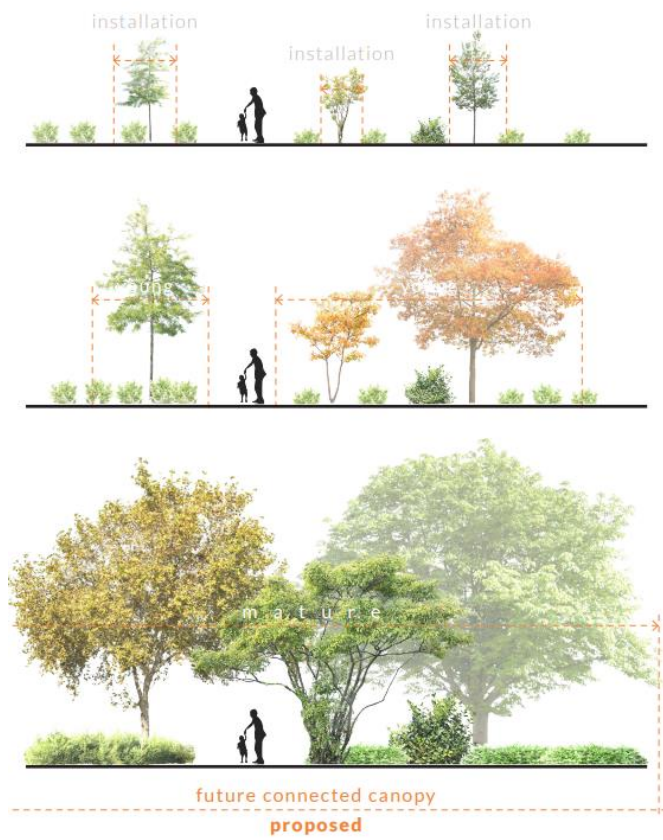
Figure 3: Illustration of Canopy Growth

Despite the loss of canopy because of the new school construction, the proposed planting plan will provide improvements to the quality of the canopy across the site. By introducing a large and diverse selection of both plant species and types, the design will establish a variety of plant communities that will bring layers of ecosystem services with it and as the trees mature, they will enhance the experience for neighbors and school children as they walk the pedestrian corridors and take advantage of the recreated open spaces.