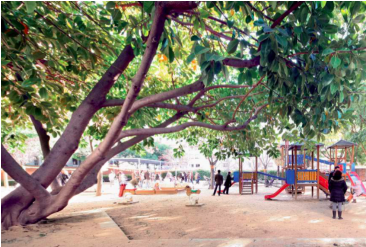
An already constructed interior courtyard garden in the Example District. ( Ajuntament de Barcelona )

Another green space will be made—controversially—by clearing away a large courtyard block in the city center that is currently partially filled by squatted, single-story 1920s workshops. A third public space will be created by opening the lush, mature 7.5-acre garden of a newly created house museum to the public. A fourth park will be opened on what is currently a small, scrappy piece of ex-industrial semi wasteland in the hinterlands behind the city's main container port, and a fifth will be created as part of a long-stalled but newly revived redevelopment of an outlying barracks.