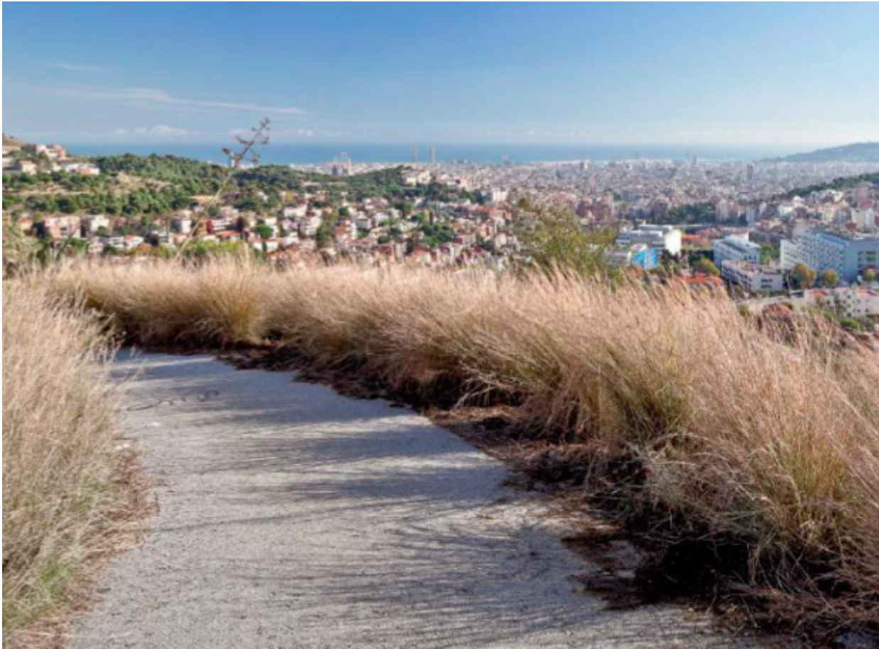
View from the Parc dels Tres Turons, located in the hills behind Barcelona's city center.

In its core, Barcelona is built up more or less to the last square inch, with a network of historic streets and alleys supporting a population density greater than Manhattan's. This area's sea of buildings is sometimes softened with avenues of trees, small gardens , and one modest but beautiful park —but it can still feel heavy-aired and claustrophobic on Barcelona's many hot days.