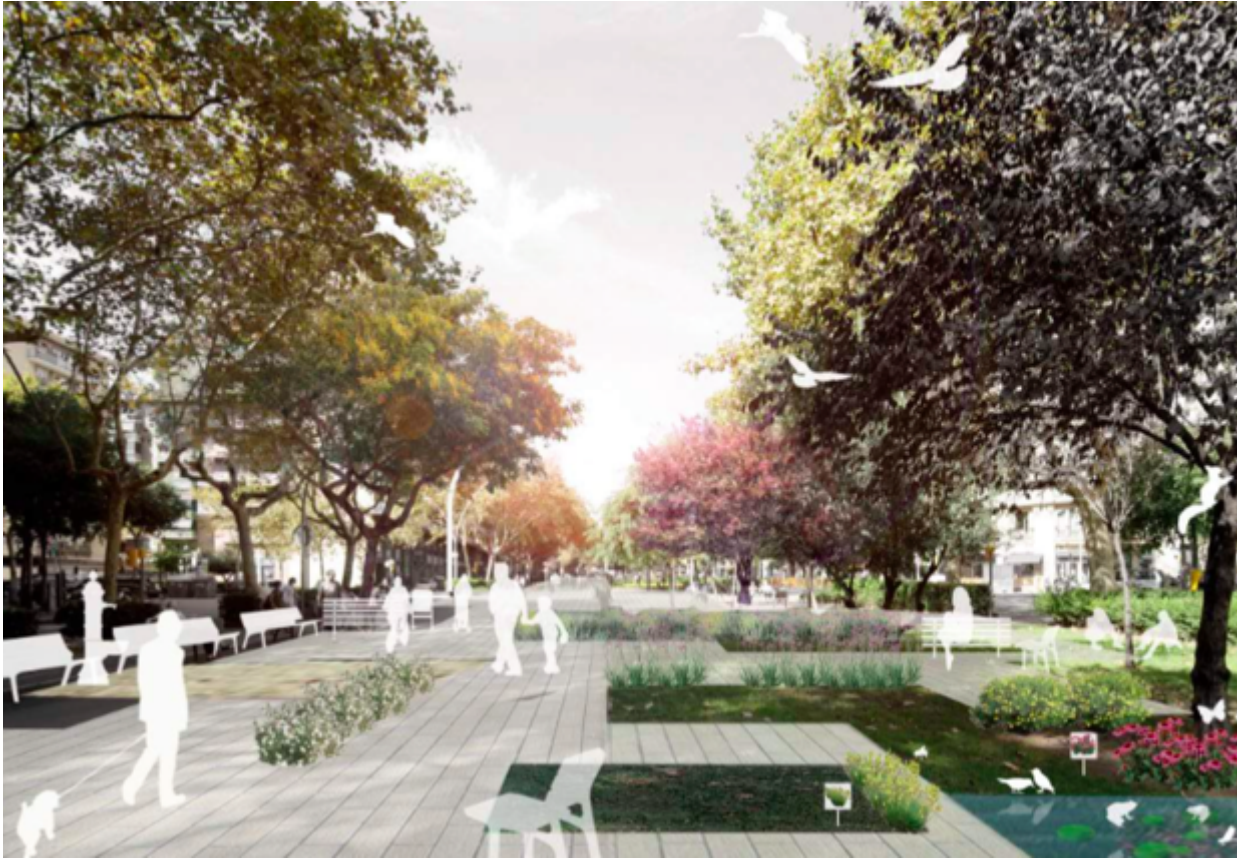
How the green corridors could look at ground level. Ajuntament de Barcelona

If Barcelona seems especially keen on these corridors, it's partly because they have already been tried and proved a success. In 2000, the city opened a long, slender park along the banks of the river Besós , a formerly filthy stream passing through industrial lands in the city's northeast. Since being cleaned up and partly reopened to the public (some areas are protected wetlands), the river banks (viewable here ) have thrived with plants suited to brackish water while the river itself is now alive once more with eels, frogs, and terrapins.