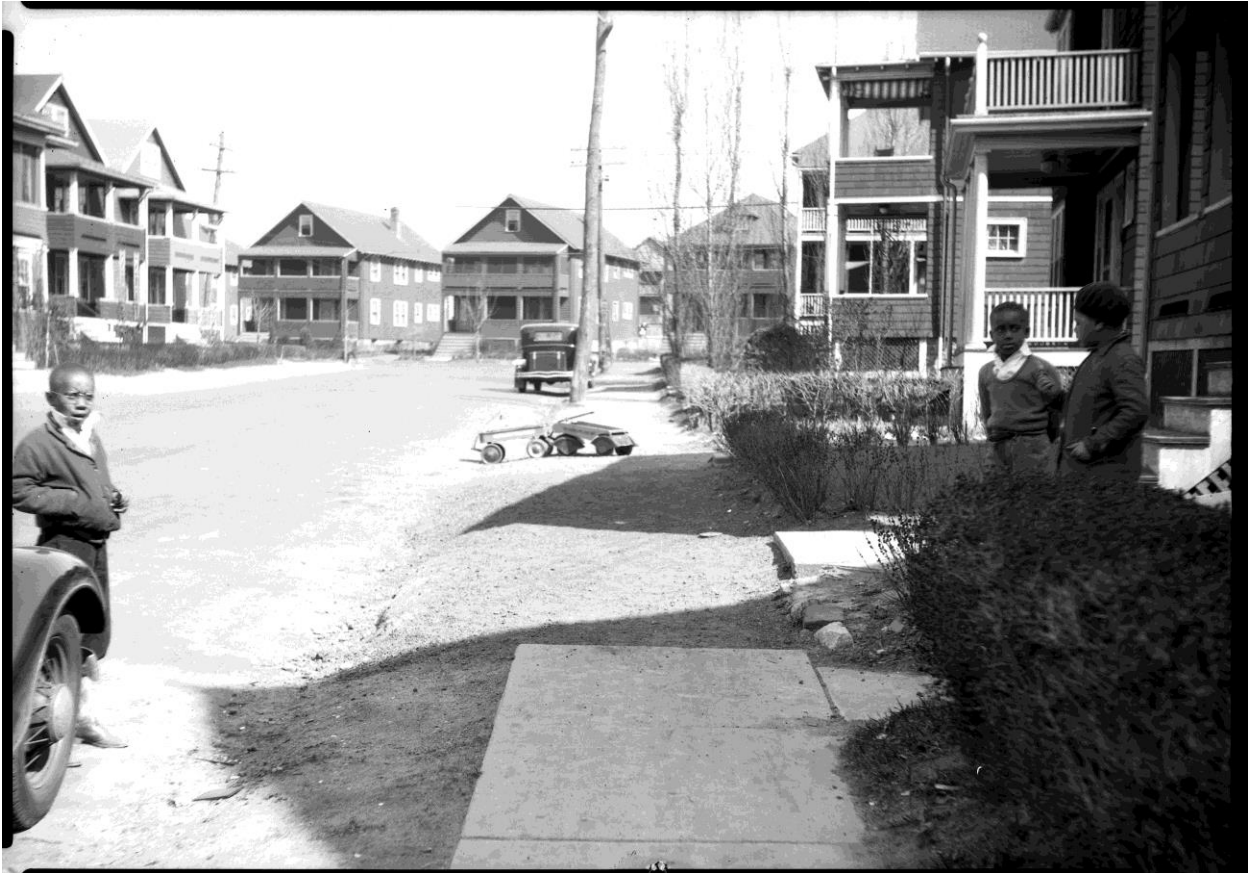
204-206 Fayerweather Street (looking east toward Walden Street), 29 April 1935.