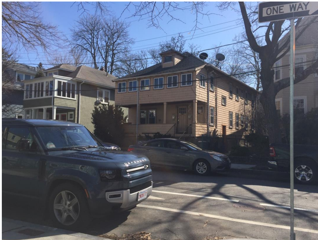
204-206 Fayerweather Street, CHC staff photo 2021

An application to demolish the two-family house at 204-206 Fayerweather Street was received on March 9, 2021. The applicants, Tom & Keya Dannenbaum, were notified of an initial determination of significance, and a public hearing was scheduled for April 1, 2021.