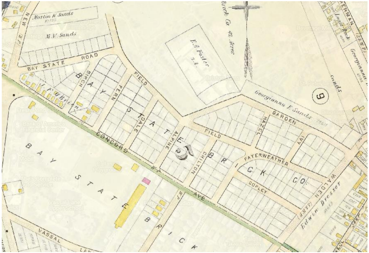
1900 Stanley Atlas of Middlesex County