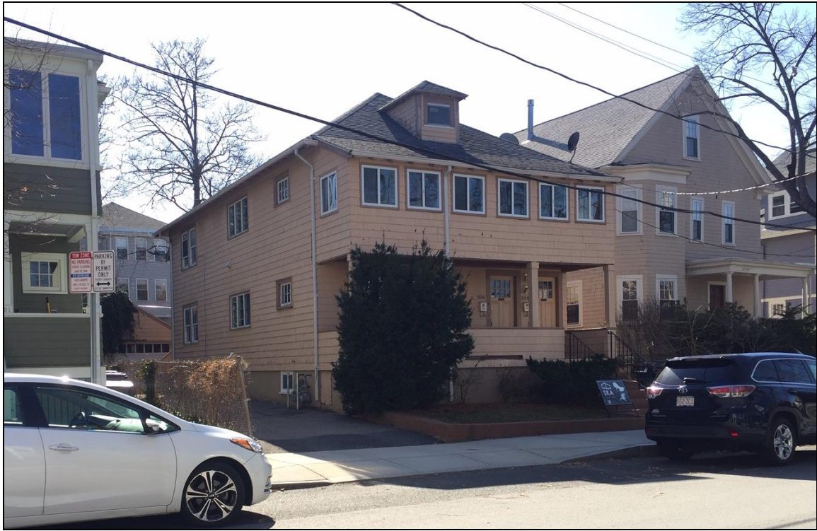
204-206 Fayerweather Street, CHC staff photo 2021