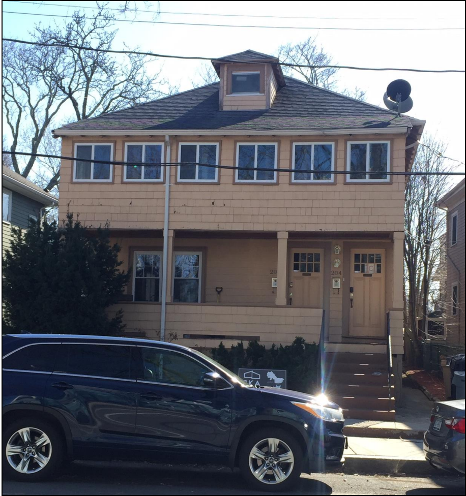
204-206 Fayerweather Street