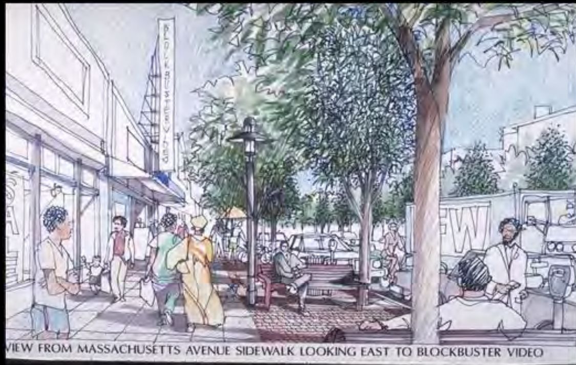
VIEW FROM MASSACHUSETTS AVENUE SIDEWALK LOOKING EAST TO BLOCKBUSTER VIDEO