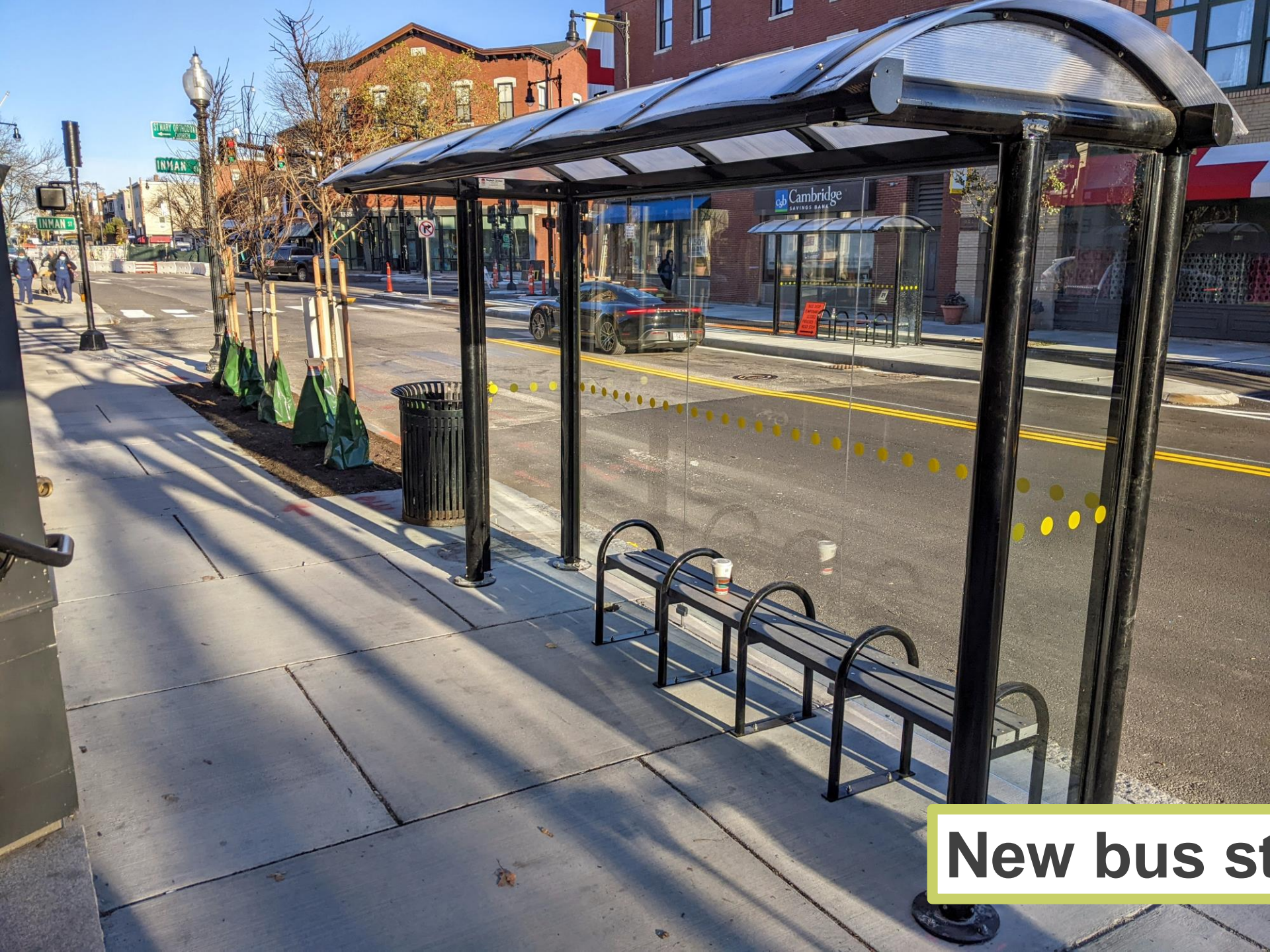
New bus stop shelters