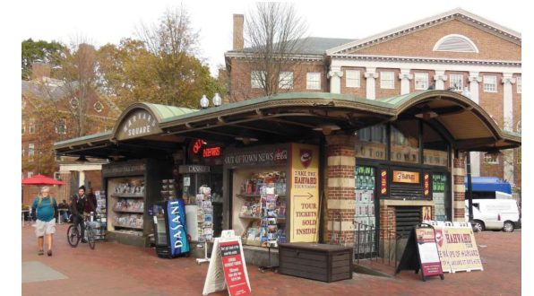
Out of Town News Kiosk.