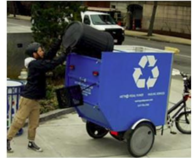
Figure 1-2: Metro Pedal Power collecting recycling

Collection service is provided under contract by the private sector using semi-automated collection. Should the City consider taking on recycling collection in-house, they would have more flexibility to undertake co-collection of recycling with another stream, possibly organics. Containers would have to be compatible with whatever system the City will choose for collection of organics and trash. This may be an option to consider once the organics program has been established and if the City moves to a collection option whereby organics are collected weekly and trash and recycling are collected on alternate weeks. Any potential reduced frequency of recycling collection may also necessitate provision of additional recycling containers as the current usage of the containers is very high. This may negate any efficiencies gained through potential fleet size reductions as more time will be spent emptying additional containers and/or transferring materials to the MRF.