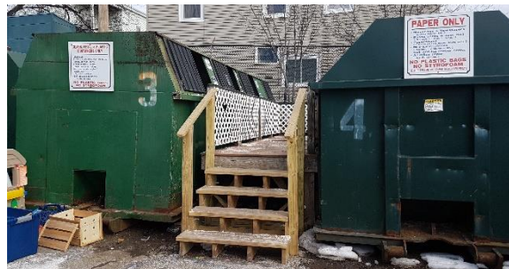
Figure 1-3: Recycling Collection Bins at the Recycling Center

The Recycling Center is located in a far corner of the DPW yard with no designated parking or drop-off areas for vehicles. It is surrounded by parked DPW vehicles and storage bunkers and therefore somewhat difficult for the public to find and navigate.