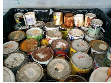
Figure 1-4: HHW Collection

The City holds four HHW collection events annually in four locations in the City in April, June, September and November. Some HHW materials are accepted at the City's Recycling Center including mercury containing devices, non-alkaline batteries, discharged fire extinguishers, fluorescent bulbs, and empty gas canisters. Beyond these materials, should residents have HHW materials they wish to dispose of, they must either store them until a HHW collection event is held or find a private disposal option. It is very likely that in a city with a high proportion of multi-residential dwellings with limited storage space and residents who do not have a car to transport materials easily, hazardous waste is being disposed of in the garbage.