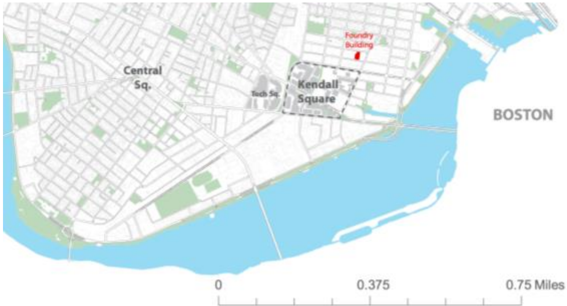
Foundry Location Map

flourished beyond the boundaries of the KSURP, creating a larger district of highly specialized technology and biotechnology companies.