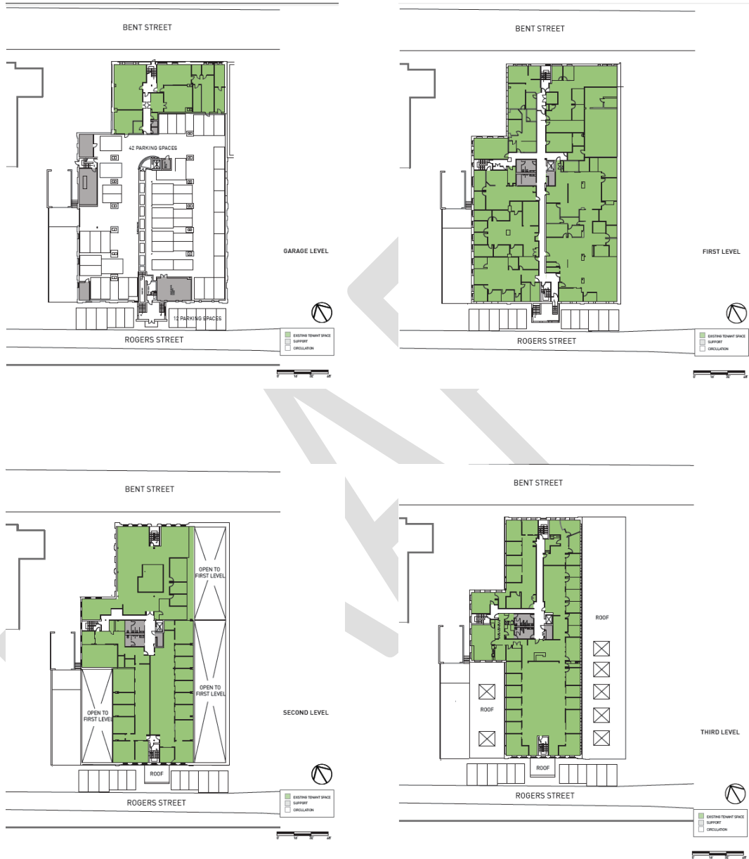
Existing Foundry Floor Plans

Fire Protection: Areas of the building require improved fire protection. The fire alarm system does not meet code, and the fire pump room requires a direct egress to the outside. Significant code upgrades are needed to reach the Occupancy Type B requirements necessary for a broad range of uses.