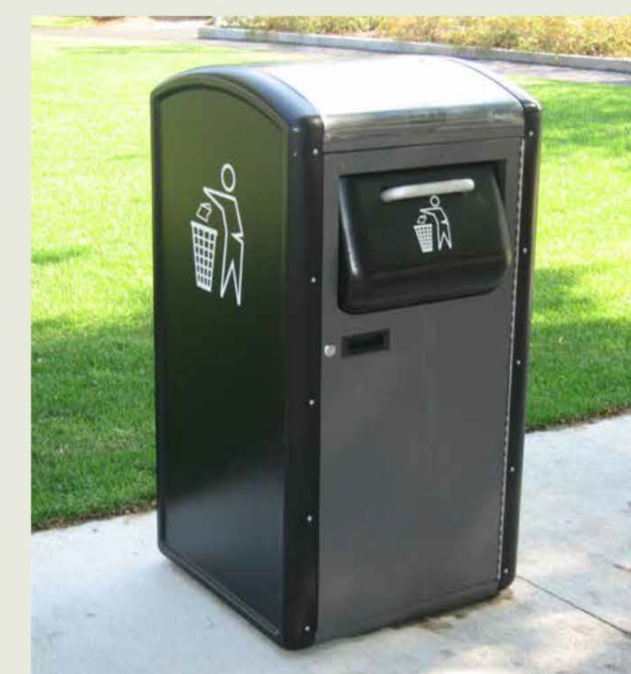
▲ TRASH RECEPTACLE