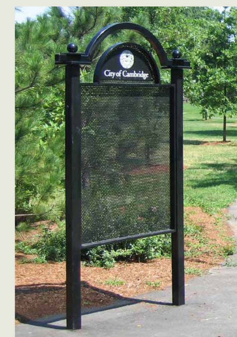
▲ MESSAGE BOARD