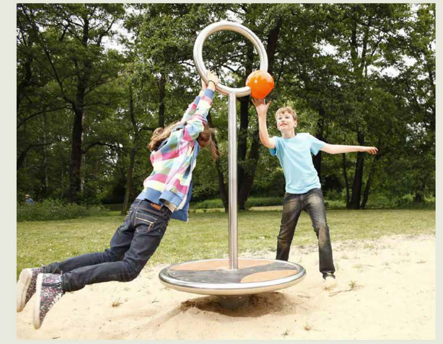
▲ "FIREBALL" SPINNING DECK