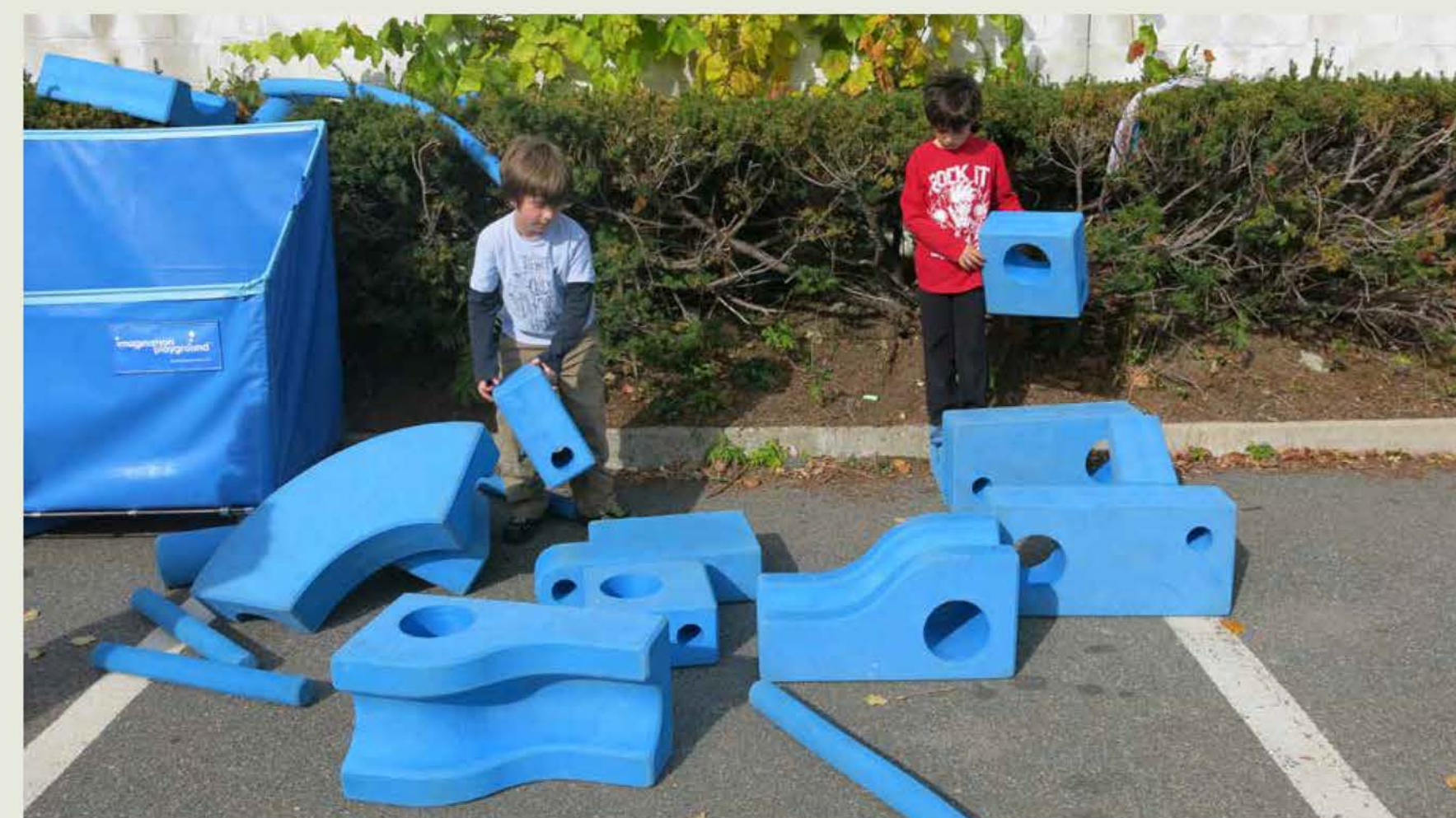
▲ STORAGE WITH LOOSE PARTS/PLAY PROPS