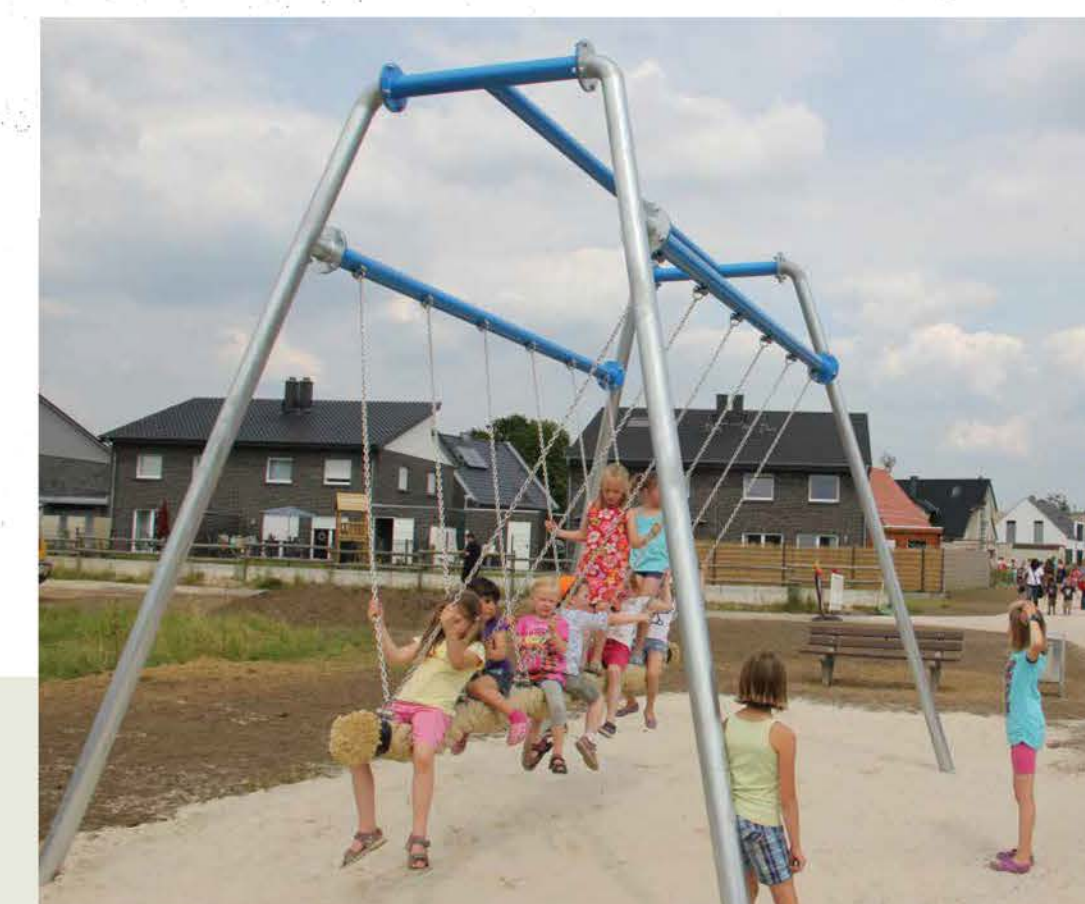
▲ "VIKING" GROUP SWING