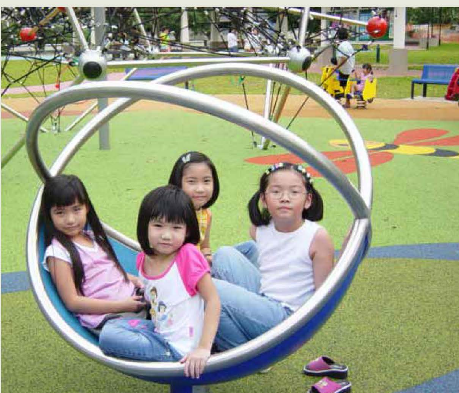
▲ "NEST" GROUP CAROUSEL