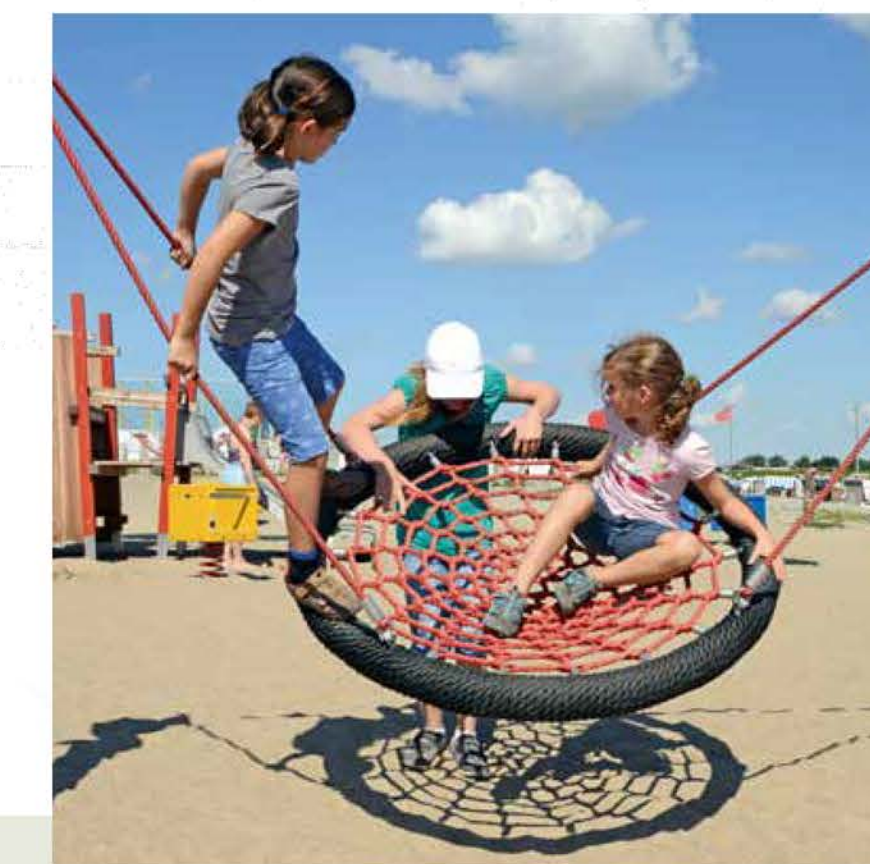
▲ GROUP BASKET SWINGS