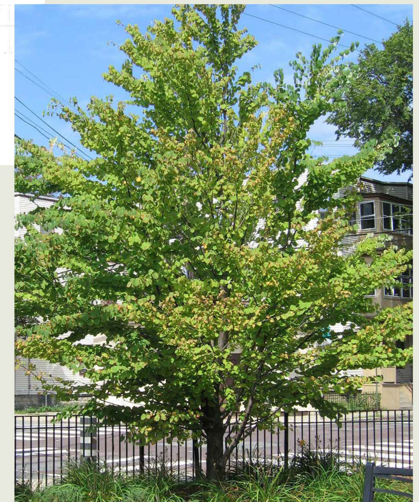
▲ ADDITIONAL SHADE TREES