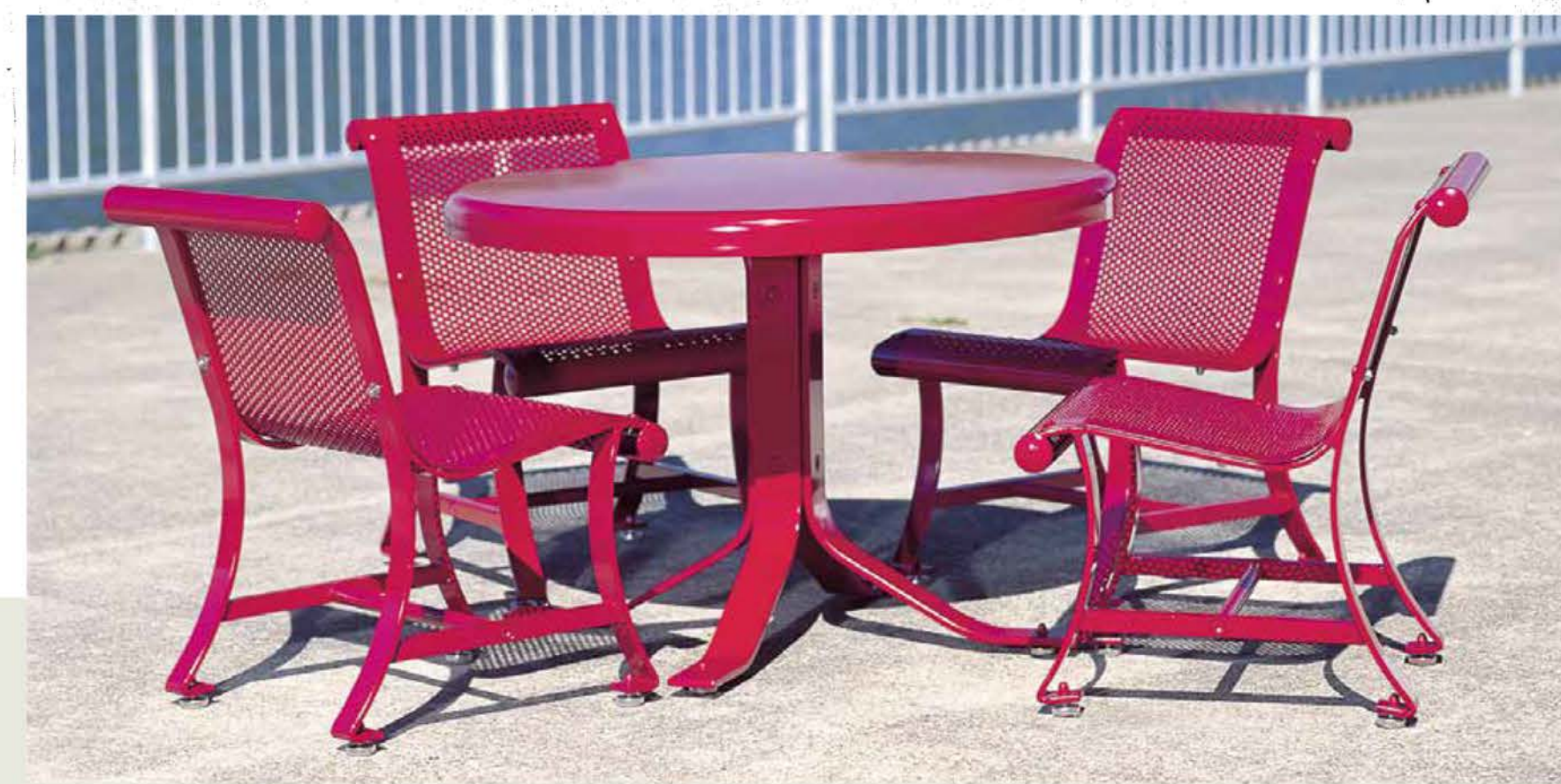
▲ TABLES & LOOSE SEATING

Cambridge Community Development Department 2018