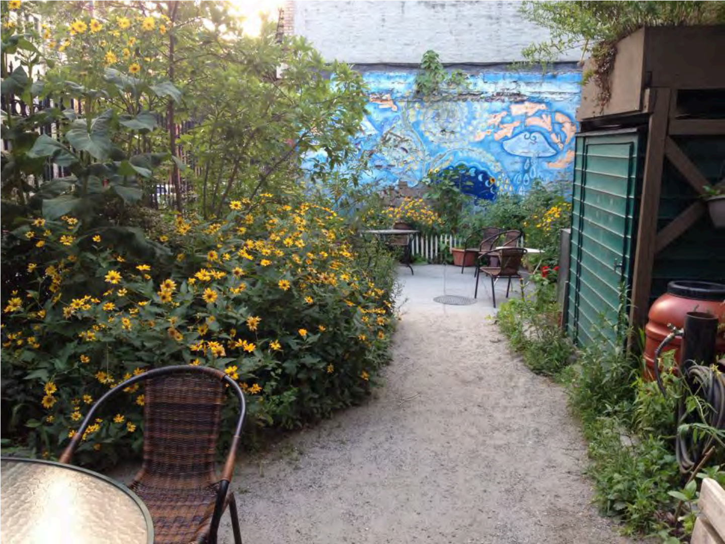
GREENSPACE @ PRESIDENT STREET, BROOKLYN, NYC