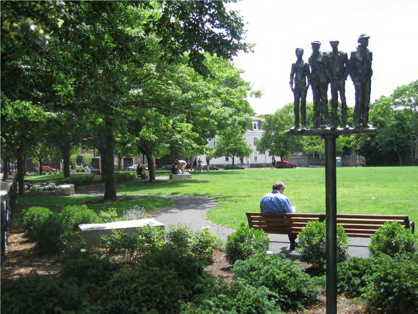
SENNOTT PARK, CAMBRIDGE