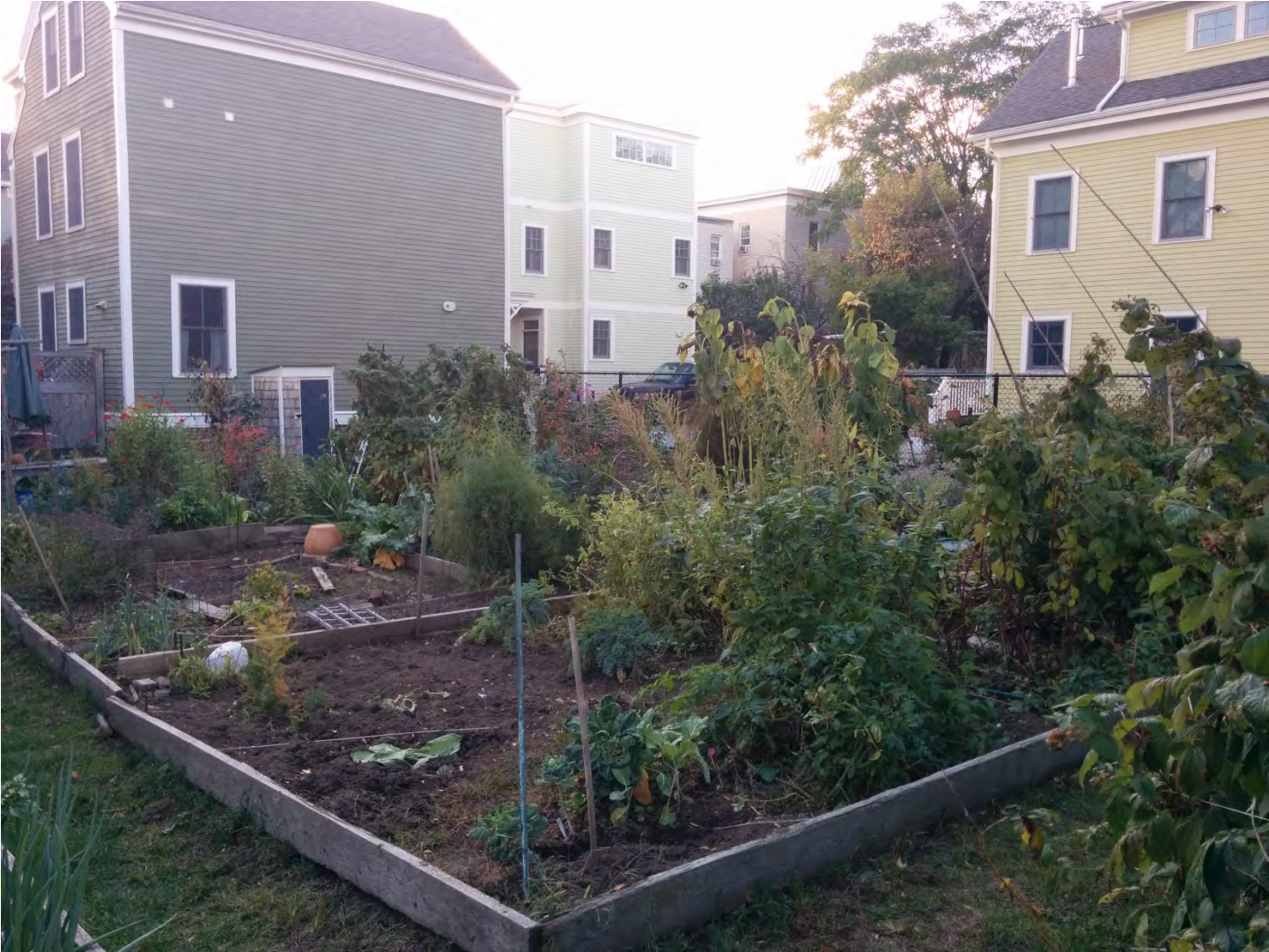
PEGGY HAYES COMMUNITY GARDEN, CAMBRIDGE