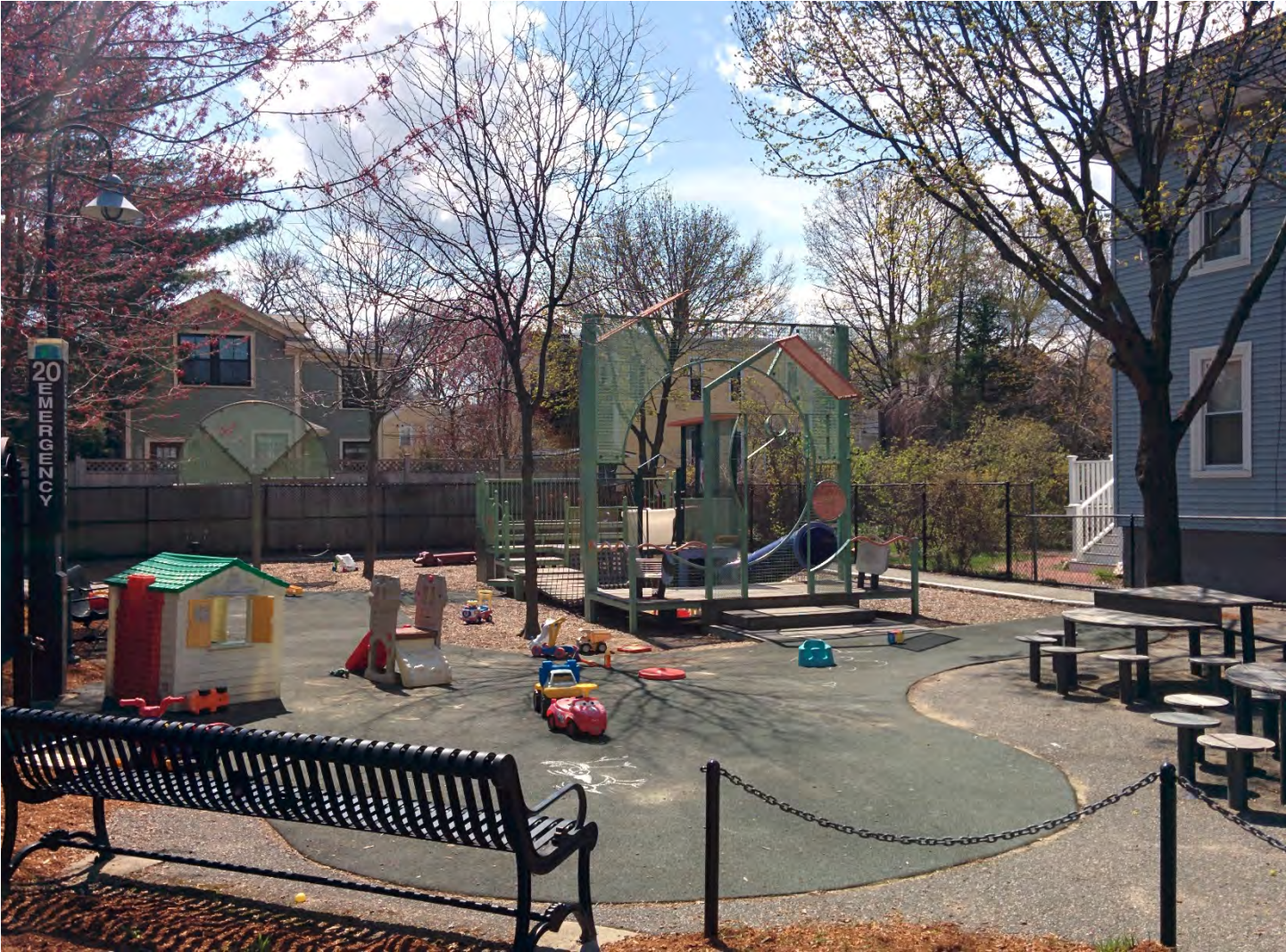
LOPEZ STREET PARK, CAMBRIDGE