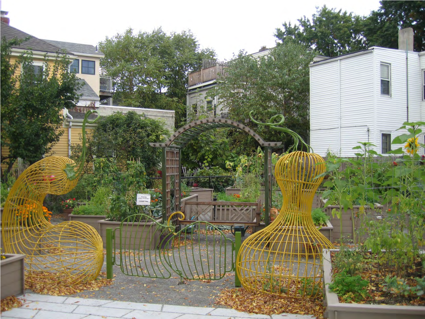
COSTA LOPEZ TAYLOR PARK AND COMMUNITY GARDEN, CAMBRIDGE