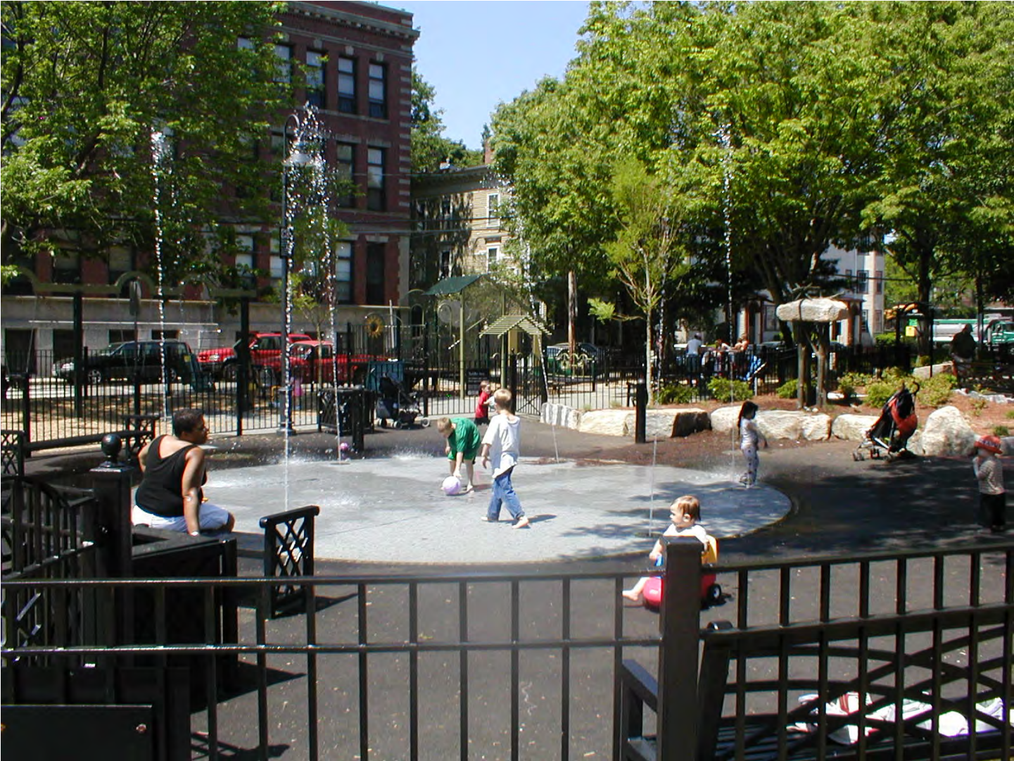
DANA PARK, CAMBRIDGE