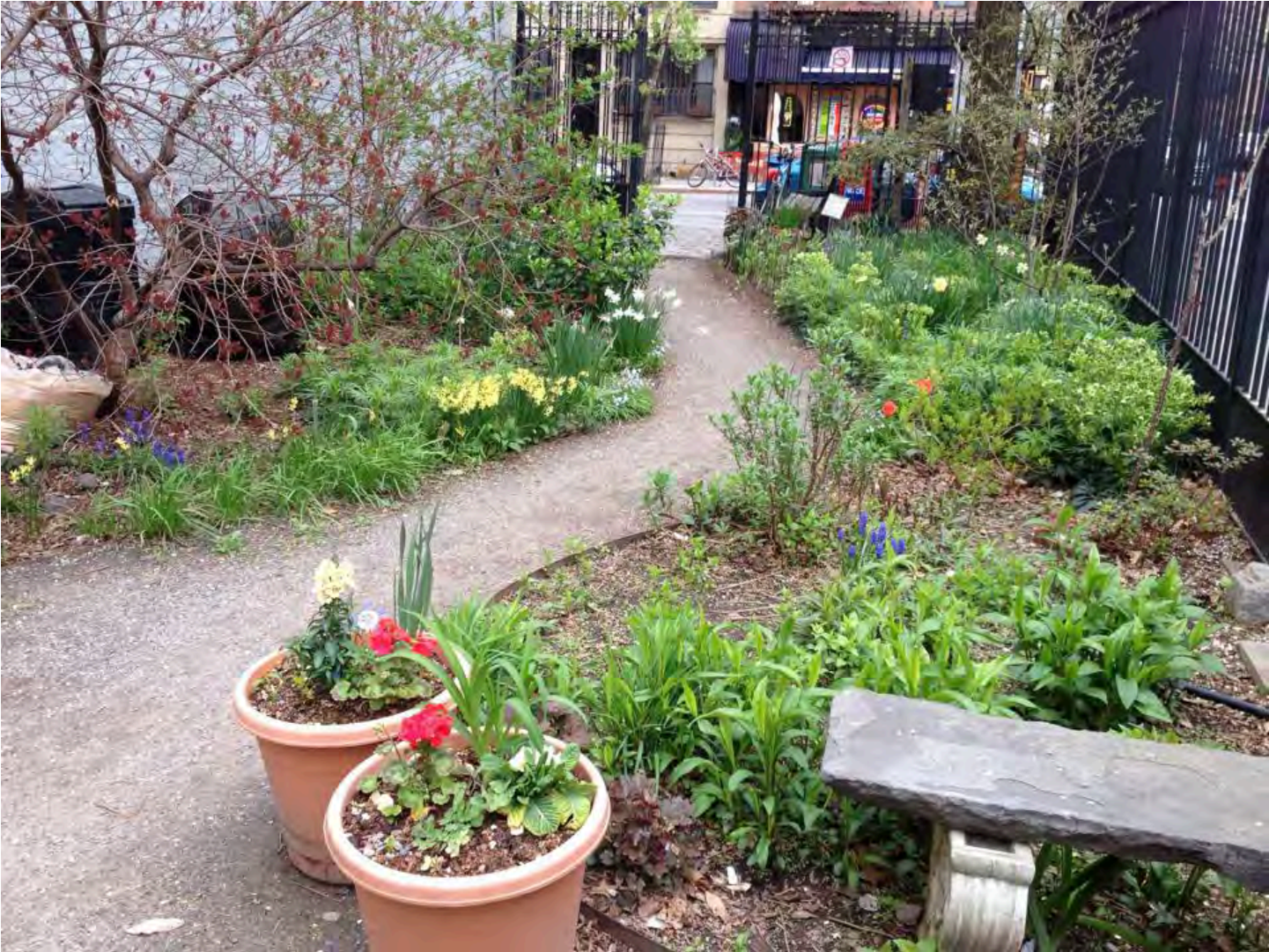
GREENSPACE @ PRESIDENT STREET, BROOKLYN, NYC