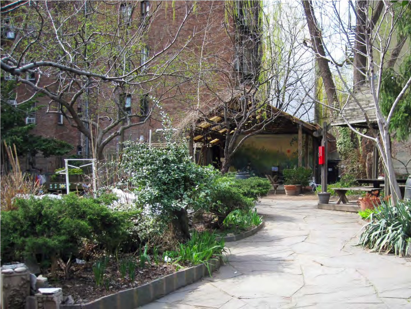
6TH AND B GARDEN, MANHATTAN, NYC