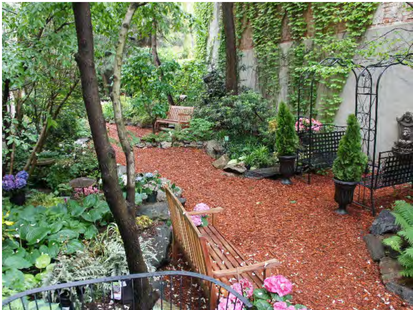
CREATIVE LITTLE GARDEN, MANHATTAN, NYC