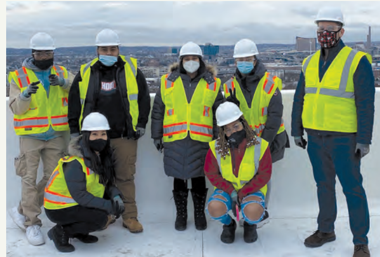
Participants of the Next Up program visit a work site.

The Cambridge STEAM Initiative collaborated with the Birth to Third Grade Partnership to organize a workshop series for Preschool/JK/K Out-of-School Time staff focused on environments and activities that foster curiosity. Staff have engaged local STEAMers to deliver workshops, promoting shared learning and connection. The STEAM Initiative is partnering with Science Club for Girls, Broad Institute, Cambridge School Volunteers, Lemelson MIT, MIT Museum to develop a Spaces of Belonging training system for industry and community volunteers to ensure that all adults who mentor Cambridge's diverse young people engage through an anti-racist lens to create spaces of belonging. Teen focus groups were organized to assess the impact and efficacy of the training and its resonance. The STEAM Initiative also ran a successful outdoor STEAM It Up! event in North Cambridge in Fall 2021, attracting hundreds of Cambridge families.