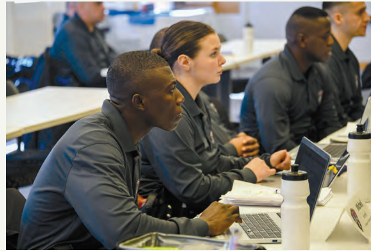
CPD is pursuing a gold standard in accreditation.

Accreditation from Commission on Accreditation for Law Enforcement Agencies (CALEA). In FY22, CPD began a complete review and re-write of its policies, procedures, rules, and regulations through the lens of procedural justice. A multi-year process, obtaining CALEA accreditation is considered the gold standard in law enforcement and mirrors the department's mission of procedurally just policing. As the result of the work