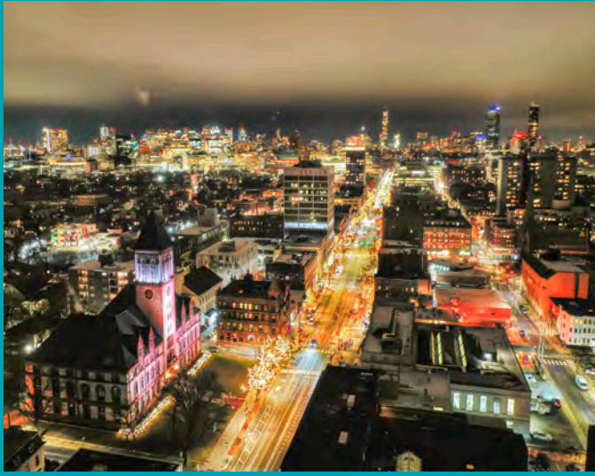
Photo: Nighttime view of Cambridge with City Hall in the foreground by Kyle Klein.