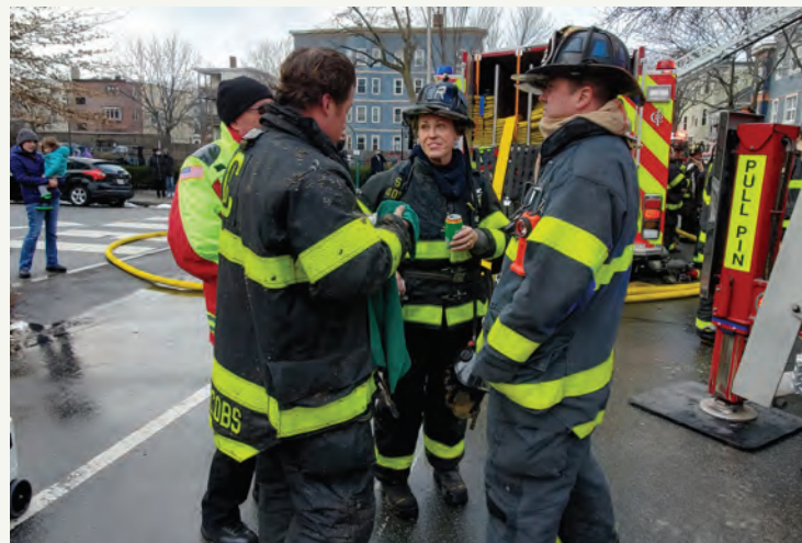
Cambridge firefighters rest after responding to an incident.

COVID-19 Testing & Vaccination Efforts. In FY21 and FY22, Cambridge Fire Department, in collaboration with Cambridge Public Health and Cambridge Police departments conducted citywide COVID-19 testing, and in January 2021 began providing COVID-19 vaccinations, following state and federal guidance. (See COVID-19 section)