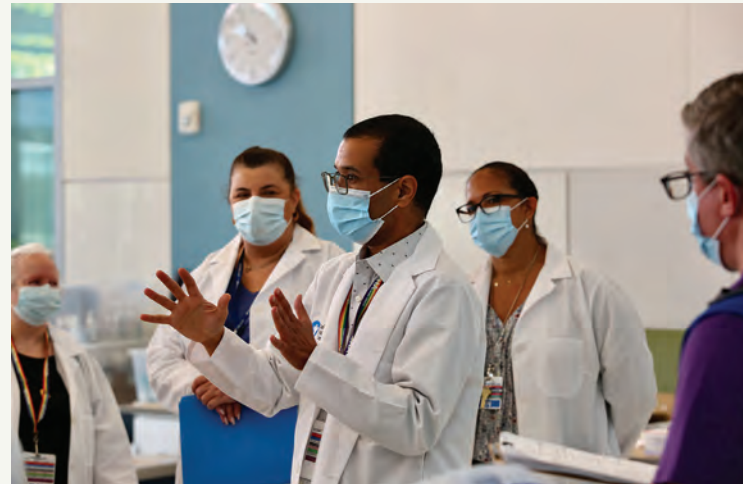
Nurses from Cambridge Public Health Department prepare for a vaccine clinic.

Equity Specialist whose work will focus on health promotion for all Cambridge students, with a particular focus on barriers and inequities related to race/ethnicity, culture, language, and socioeconomic and LGBTQ+ status.