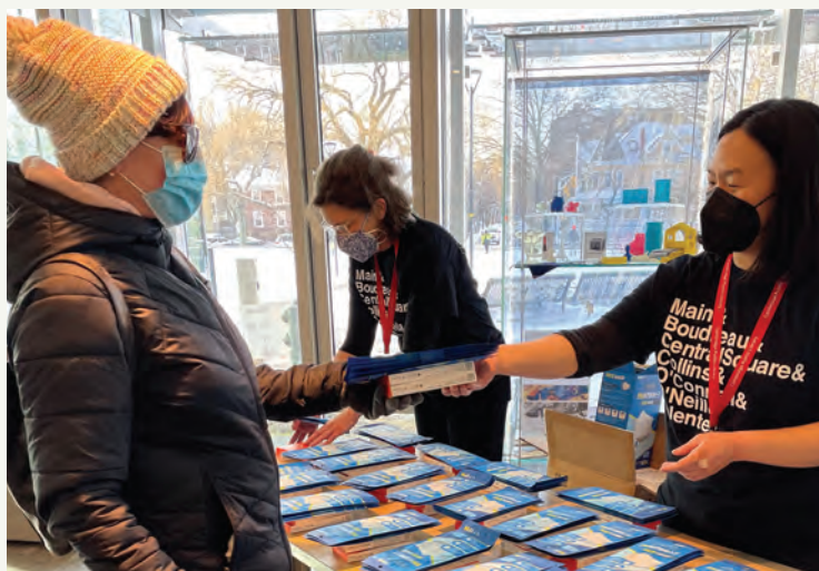
City staff hand out free at-home COVID-19 test kits.

During the 2022 State of the City Address in April, it was announced that the City of Cambridge will be allocating close to $22 million in ARPA funding to build on the work of the Cambridge RISE pilot and combat the adverse effects of the pandemic faced by low-income families in Cambridge. This allocation will provide direct cash