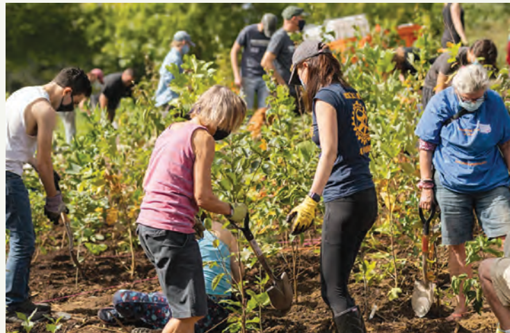
Volunteers work to plant 40 native species of plants at the Miyawaki Forest at Danehy Park.

Textiles Recycling. In December 2021, the City launched a drop-off and weekly curbside pickup Textiles Recycling Program, Cambridgema.gov/textiles .