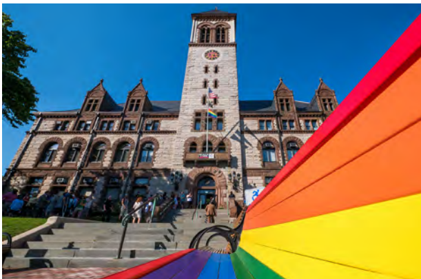
Cambridge City Hall

Since 2018, over 80 City leaders have been learning together in four Cohorts which are guided by a set of Leadership Expectations grounded in four Core Beliefs.