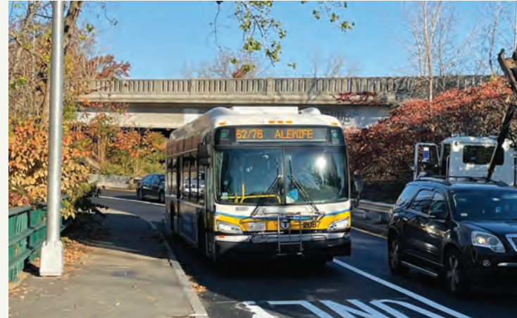
MBTA bus in dedicated bus lane on Route 2.

Traffic Signal Priority for Buses. Work advanced on purchase and installation of transit signal priority equipment on Concord Avenue, from Cambridge Common to Blanchard Road, through a $160,000 grant the City received from Boston Region Metropolitan Planning Organization. With assistance from MBTA Transit Priority group, development of signal timing