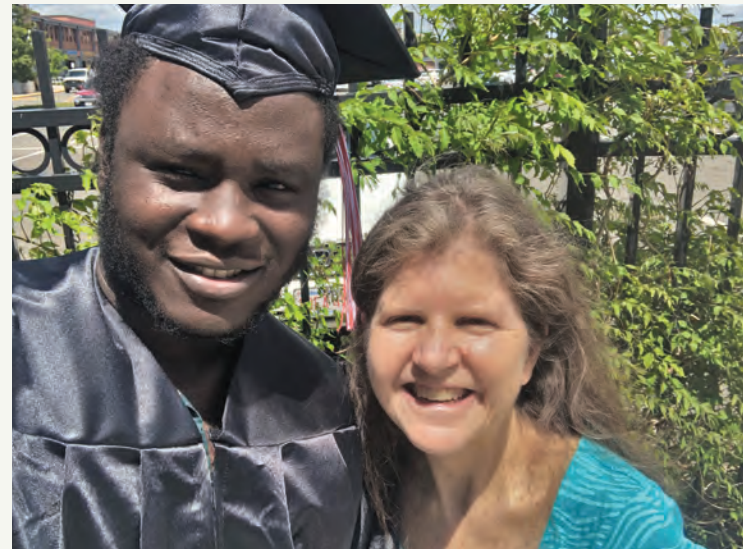
A College Success coach celebrates with a college graduate who participated in the College Success Initiative.

Just A Start Youth Build , working in collaboration with City Housing staff, provided building rehab training opportunities to 38 at-risk youth.