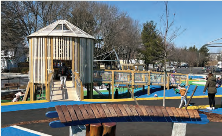
Louis A. DePasquale Universal Design Playground at Danehy Park.

Our Cambridge Street (Inman Square/Cambridge Street Corridor Planning). The Envision Cambridge plan articulated a shared vision for sensitive growth by identifying the type, scale, and location of development needed to meet community goals. Inman Square and Cambridge Street were identified as areas with potential to advance the City’s priorities. In FY22, the City started a community planning process to develop place-specific recommendations to realize shared community goals for this area.