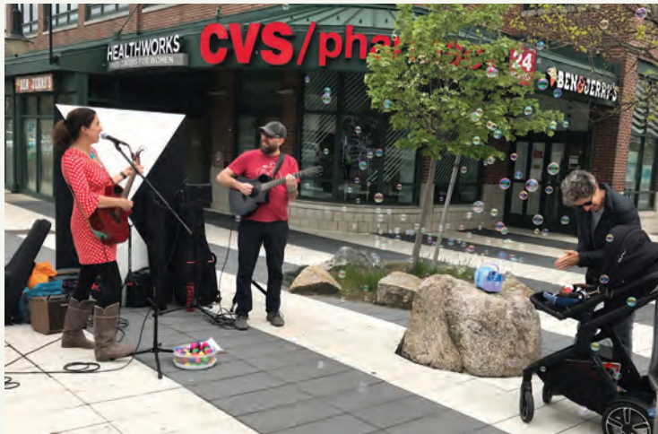
A Cambridge Plays event in Porter Square.

Tourism, Economic Development and Arts Committee. City departments continue to partner with Cambridge Office for Tourism and Cambridge Arts Council to support arts, tourism, and economic opportunity. In FY22, the group collaborated on online and social media promotions for small businesses; Open Studios Creative Marketplace; and Cambridge Plays, a series of outdoor music, arts, and play events in commercial districts and parks.