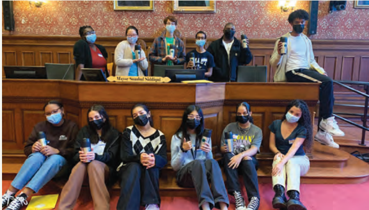
Cambridge Youth Council.

Library Branch Hours were Expanded to at least five days of library service, including three nights, at all branch locations for an increase of over 50 hours of service per week across the library system. This also includes expanded Saturday hours and a pilot of Sunday summer hours at the Valente Branch.