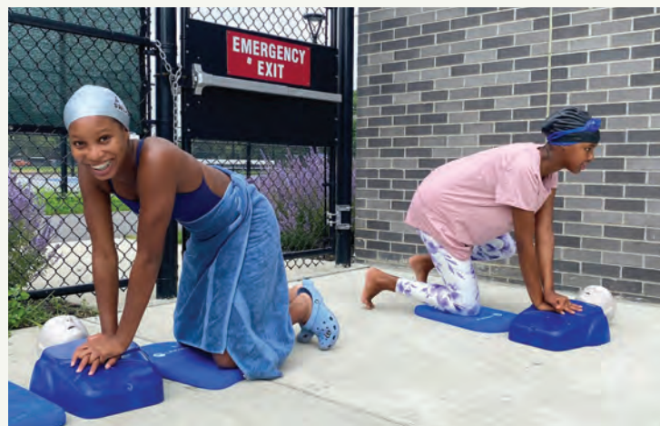
Mayor's Summer Youth Employment Program participants learn lifeguarding skills at Gold Star Pool.

The Cambridge Program and Camp Rainbow returned to in-person programming, providing connection, care, and recreation to over 100 children and adults with disabilities. In December 2021, the Cambridge Program holiday play featured 42 talented actors from the program. In April 2022, the Cambridge Program's two basketball teams became Massachusetts Special Olympics State Champions after winning division tournaments.