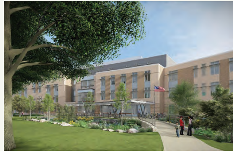
Rendering of Tobin-Montessori School entrance.

Renovated Foundry Building to Reopen in Fall 2022 as Center for Creativity and Collaboration. A $45.5 million transformation of the historic Foundry Building at 101 Rogers Street is nearing completion and is expected to open this fall. The building, originally constructed as an iron foundry in 1889, is an adaptive reuse project that will reopen as a self-sustaining center for creativity and