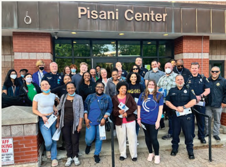
The CET and Cambridge Police collaborated on door-to-door neighborhood outreach.

The Community Engagement Team’s (CET) efforts shifted from pandemic crisis work to more sustainable family support, including sharing educational resources and career opportunities with Cambridge families. CET hosted 4 virtual networking events on best community