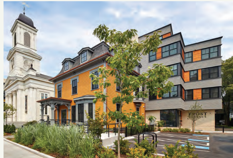
The completion of Frost Terrace in FY22 brought 40 new affordable housing units to Porter Square.