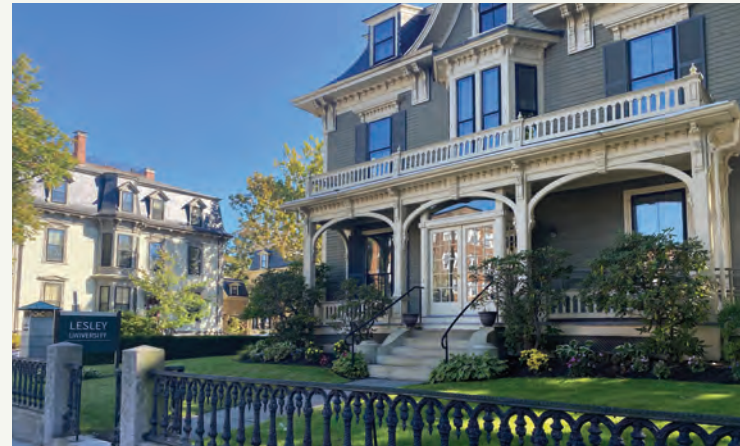
Planning will soon begin for the creation of new affordable housing at 1627 Massachusetts Avenue near Harvard Square.