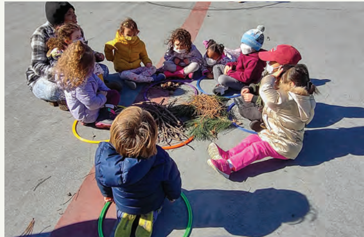
Preschool children enjoy stories around a pretend campfire.

The Office of Workforce Development (OWD) , based out of the Department of Human Service Programs, partnered with Innovators for Purpose to pay students to work in a social justice-oriented design and innovation studio. OWD also collaborated with Cambridge STEAM Initiative to support high school students in a Science Research Mentoring Program at the Harvard and Smithsonian Center for Astrophysics and MIT. OWD continued to operate the Youth Employment Center at