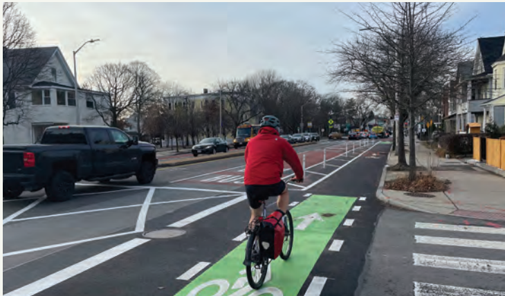
A cyclist in a separated bike lane along Massachusetts Avenue.

Linear Path Reconstruction & Danehy/New Street Connector Path. Design work began in FY22 on two path projects. Redesign and reconstruction of Linear Park path (from Somerville line to Russell Field) will include new landscaping/trees, lighting, seating, and playful elements to engage users of all ages. The second project