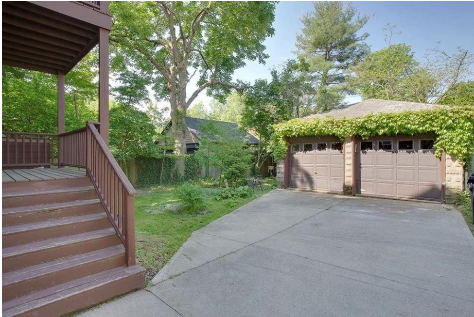
Detached concrete block garage at rear yard. Image from real estate listing 2020.