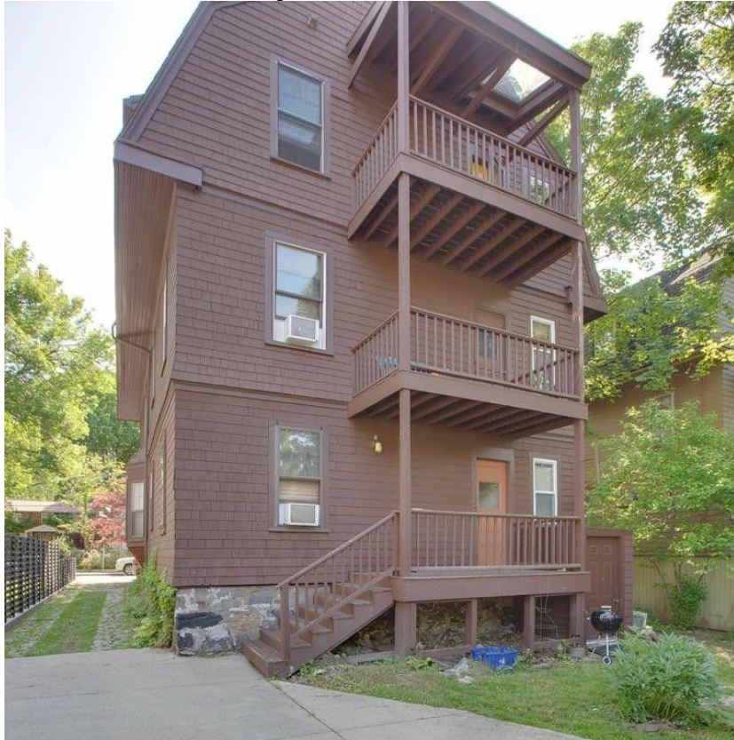
68-70 Lexington Avenue, rear decks.

At the south side elevation, a two-story octagonal bay extends between the first and second floors, ending at the roof eave. A small shingled oriel window at first floor of the north side elevation replicates the oriel seen on the façade. At the rear elevation, three small wood-frame decks are centrally located, and not visible from the street.