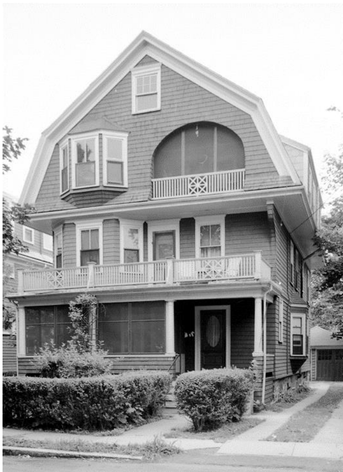
1969 image of 68-70 Lexington Avenue