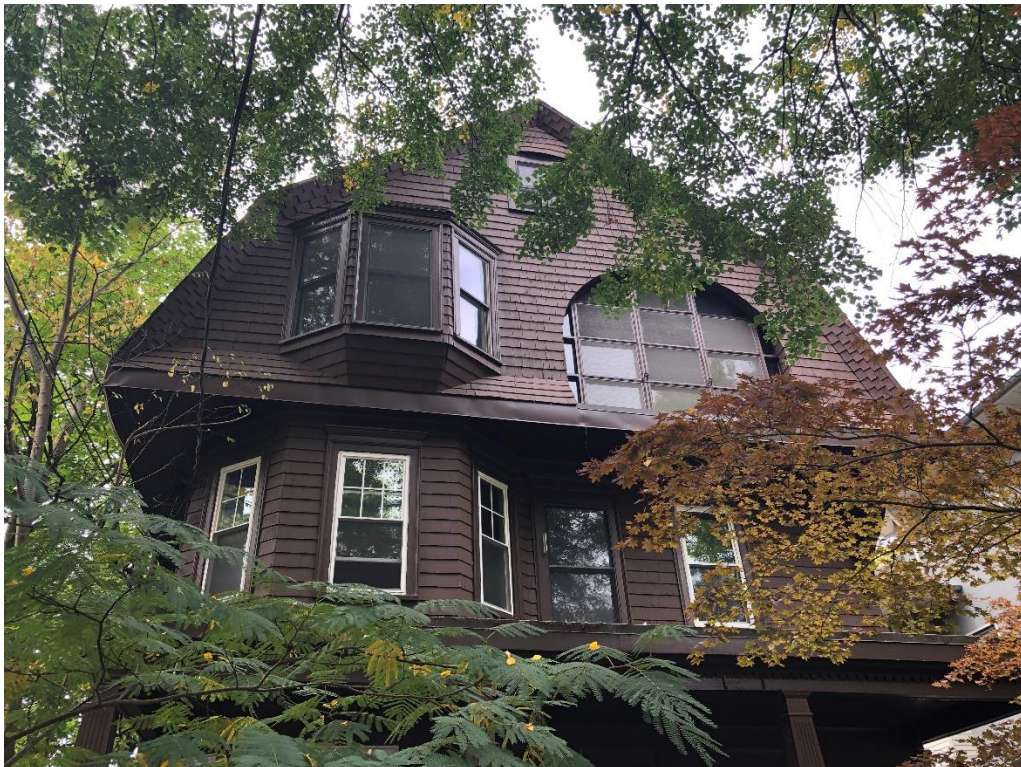
68-70 Lexington Avenue, fenestration and third floor detail. CHC photo, 2020.

At the third floor, a shingled oriel window is located above the two-story octagonal bay below, terminating at the gambrel roofline above and flared eaves below. An inset porch on the third story behind an arched opening has been enclosed with a window grid slightly behind the wall plane. At the half-story above, a double-hung window is sited centrally at the gable end.