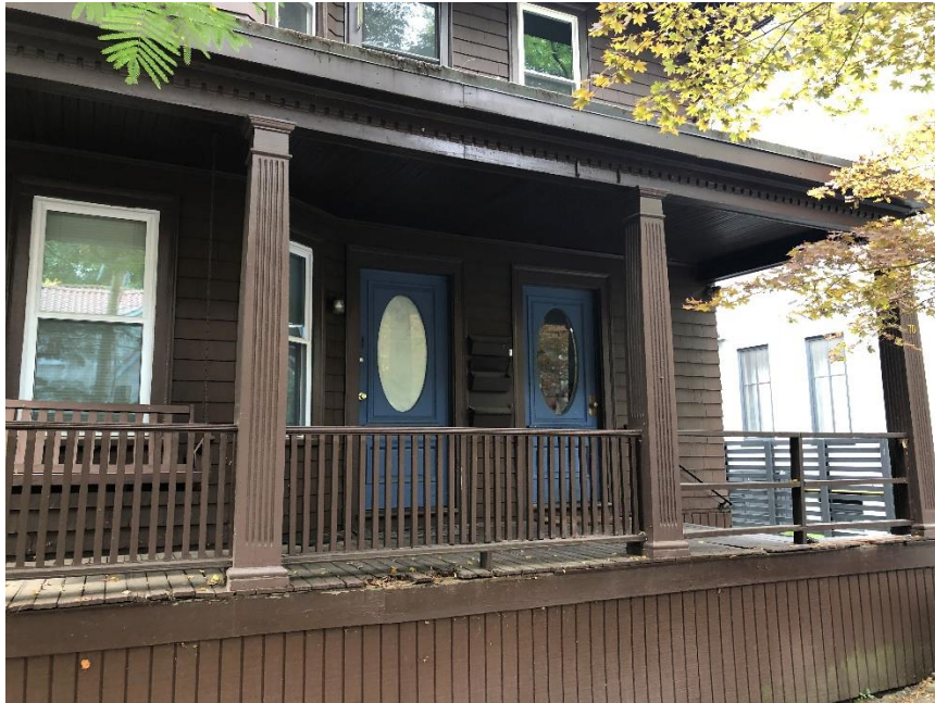
68-70 Lexington Avenue, front porch and door detail.

At the third floor, a shingled oriel window is located above the two-story octagonal bay below, terminating at the gambrel roofline above and flared eaves below. An inset porch on the third story behind an arched opening has been enclosed with a window grid slightly behind the wall plane. At the half-story above, a double-hung window is sited centrally at the gable end.