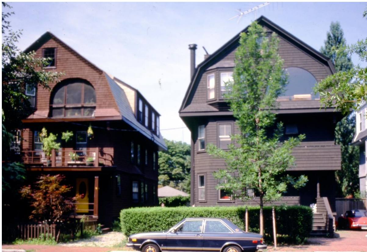
68-70 Lexington (left) and 72 Lexington (right). Note: 72 Lexington since demolished.