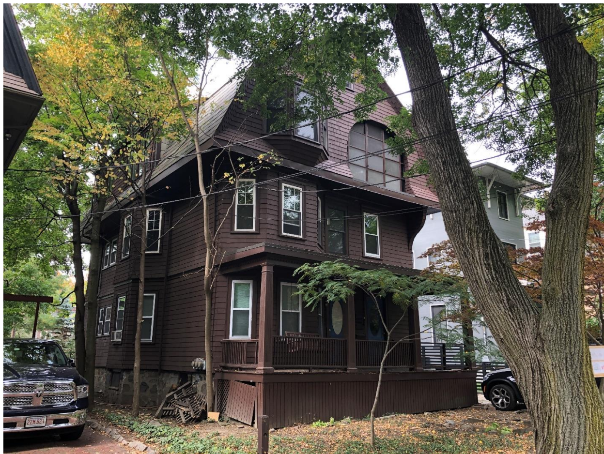
68-70 Lexington Avenue, CHC Photograph 09-2020.

The owner is a resident of the neighborhood, living next door at 72 Lexington Avenue. His house was constructed in 2013 after the previous house at 72-74 Lexington (a twin to 68-70 Lexington) was destroyed by fire. The applicants propose to demolish the existing structure and replace it with a two-story dwelling, designed in a similar style to his home next-door. They also intend to remove the rear garage structure and replace it with a surface parking spot, if required by zoning.