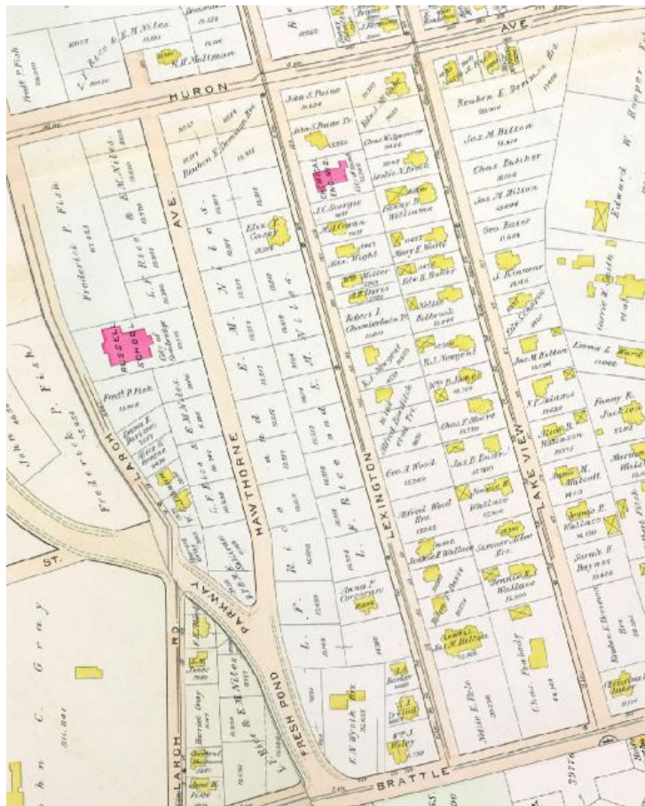
1903 Bromley Map showing Lexington Street area under development. Note: L.F. Rice & E.M. Niles listed as owners of most properties west of Lexington.