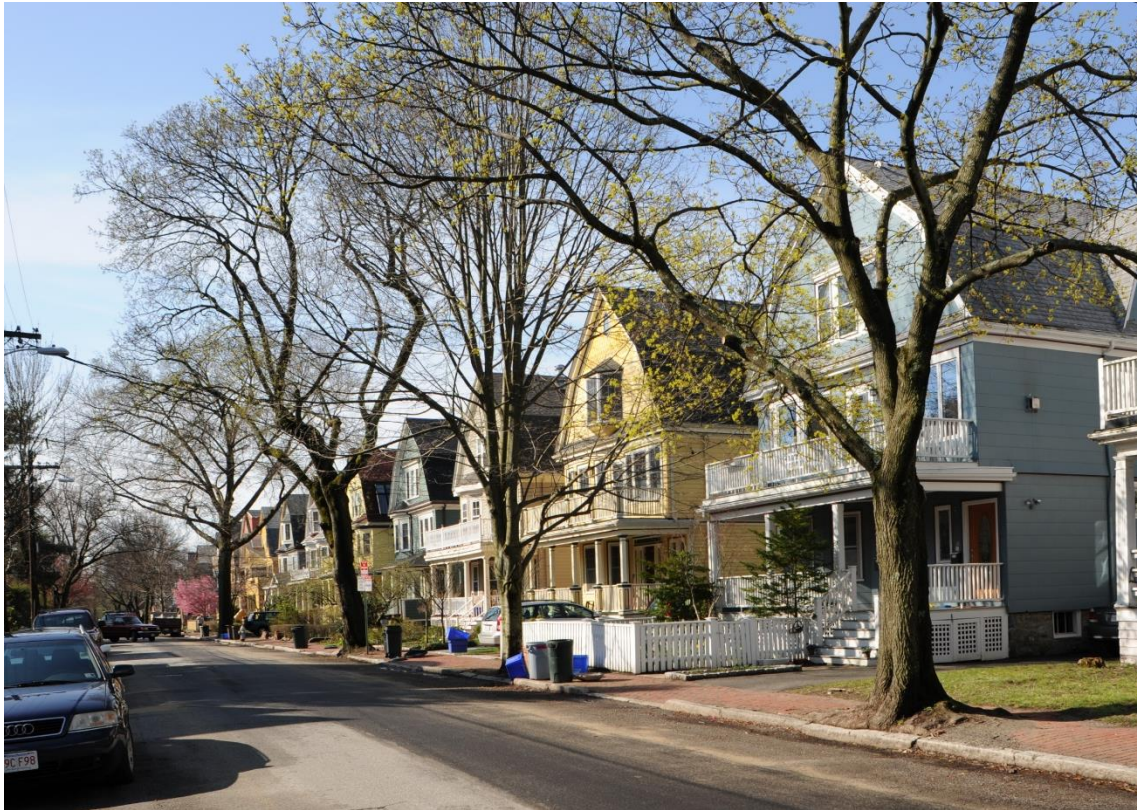
Lexington Avenue, even side, south facing.

The character of Lexington Avenue shifted from a single-family neighborhood to a denser, multi-family area with the infill construction of apartment houses and duplexes in the 20 th century. The Lowell, a high-style triple-decker was constructed at 33 Lexington Avenue in 1900, and in 1911, the stucco apartment building named the Lexington was built at #95-99. Seeing this shift in desired housing in the neighborhood, builder John L. Malcolm re-platted the old Niles and Rice subdivision on the west side of Lexington Avenue into narrow, 5,000 square foot lots. Malcolm, owner and builder, hired architect Elmer Buckley in 1912 to design sixteen gambrel-roofed duplexes and triple-deckers on the newly platted lots, creating an extremely cohesive collection of housing, the likes not seen elsewhere in Cambridge.