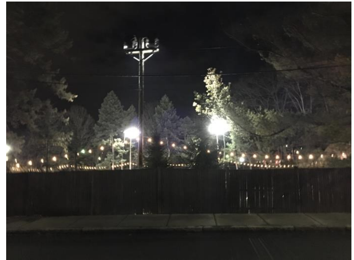
Trespassing light comes from poles on the east side of our property