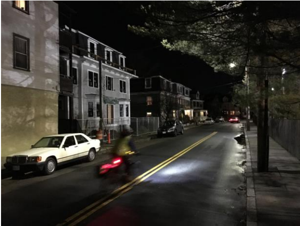
Willard Street when our lights are on

The current lamps do not control the light very well and they allow significant light spillage especially along Willard Street; the proposed LED technology directs the light to the courts and the lights are shielded to prevent stray light.