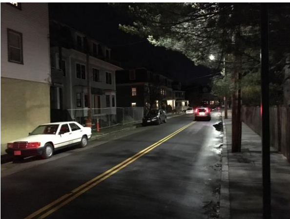
Willard Street when our lights are off