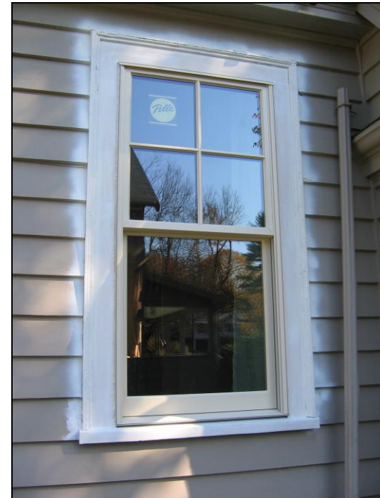
Figure 6: An entire replacement window unit. Note the framing system required to hold the sash, which reduces the window’s rough opening