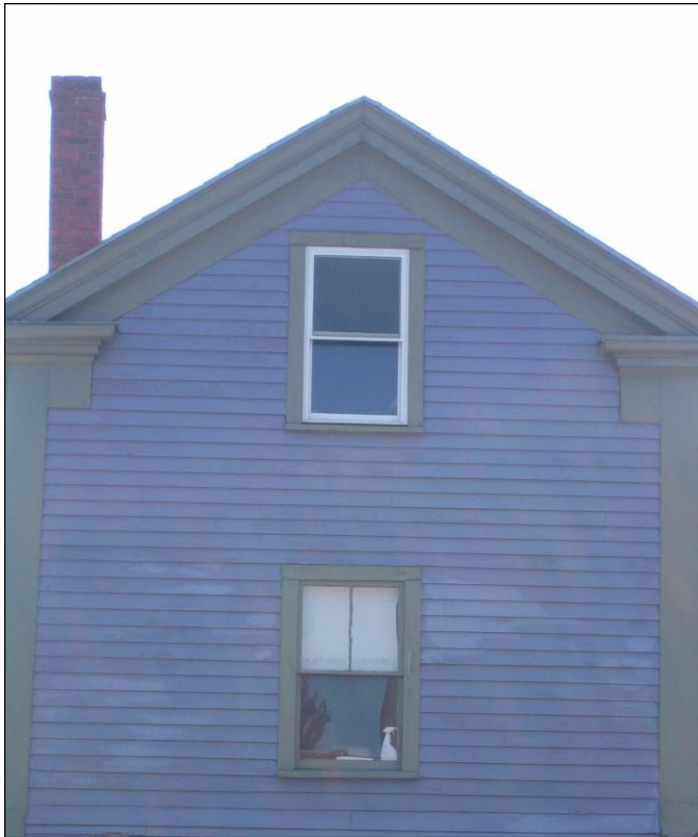
Figure 5: A vinyl replacement window (top) detracts from the historic character of this house, and is in distinct contrast with the original wood window below it

national standards and do not match “Boston Pattern” dimensions – window sash sizes that have been standard in the Boston area since the 18th century. This will involve an increase in vinyl or aluminum framing members to hold the replacement window properly, detracting from the historic character of a building. Custom sizing will add to the expense of replacement windows.