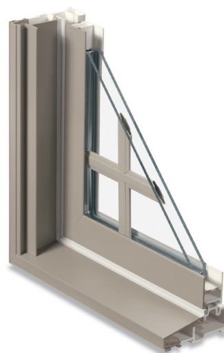
Figure 2: Cross-section of insulating glass in a vinyl replacement window unit

impossible) to repair. Vinyl windows are prone to denting, warping and fading in high temperatures. 6 In most cases, wood replacement sash have aluminum or vinyl exterior cladding meant to protect the wood as an alternative to storm windows. However, if moisture finds its way in, through weep holes or other infiltration sources, the new-growth lumber shielded beneath the cladding can quickly rot. 7