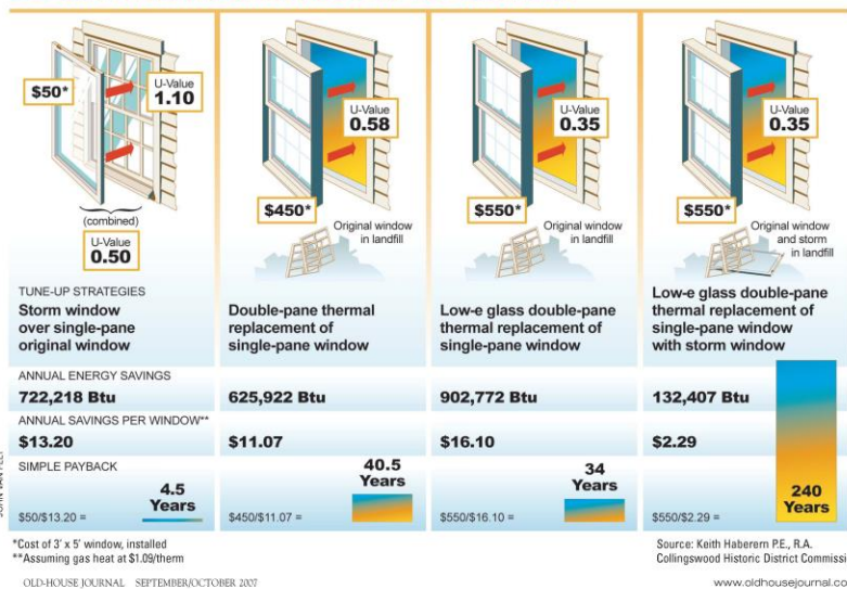
Figure 4: Energy-savings comparison chart for original and replacement windows.