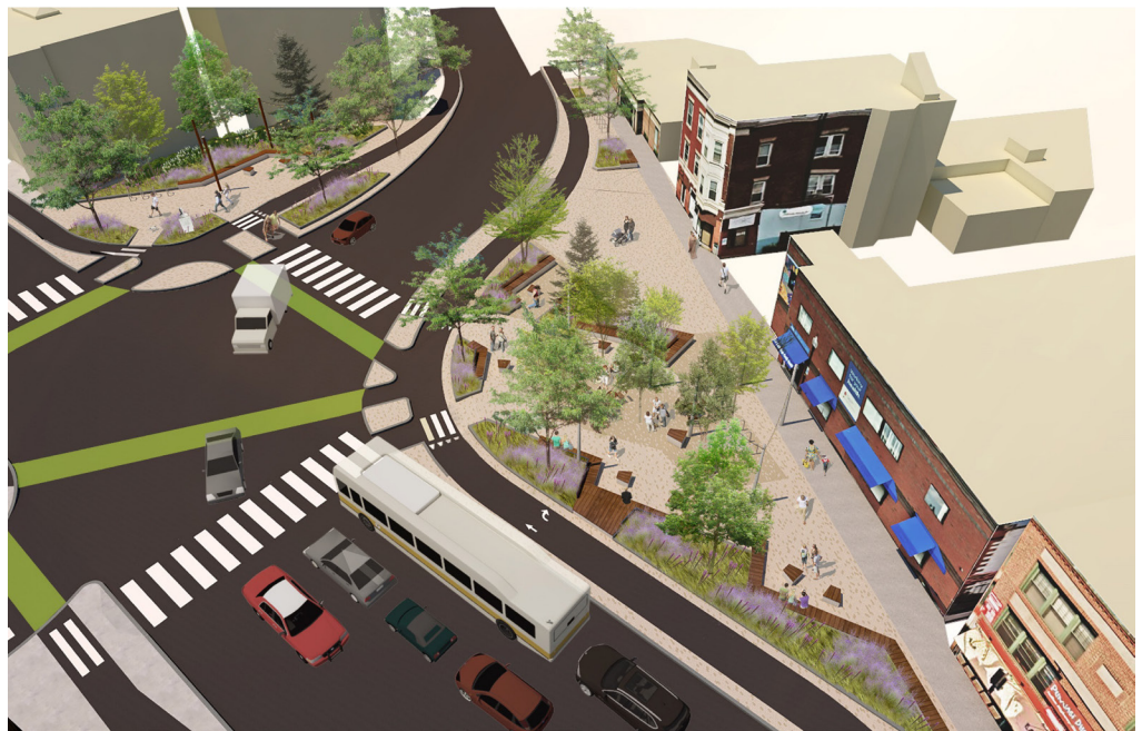
A "bird's-eye view" of Vellucci Plaza looking north to Hampshire Street after construction is complete.