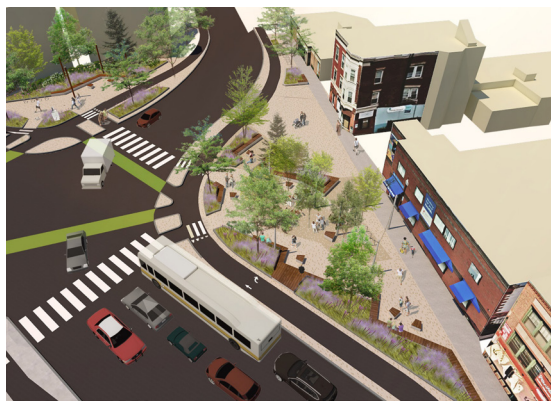
A "bird's-eye view" of Vellucci Plaza looking north to Hampshire Street after construction is complete.