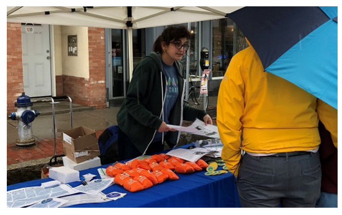
City Staff engage with the public at Inman Square Eats and Crafts in May 2019.