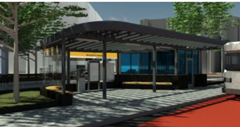
View of new River Street bus shelter at Carl Barron Plaza.

■ "The Ribbon" is a bold sculptural feature which winds horizontally and vertically through the Plaza, visually and functionally connecting the Mass Ave and Green Street halves. It will frame the plaza at the key Mass/River/Western corner, and serve as an iconic feature both day and night. The Ribbon integrates seating and lighting, as well as a platform which can be used for performances. The Ribbon will also reflect the artistic character of Central Square, as it will be painted by artist Sophy Tuttle, recently selected by the Cambridge Arts Council. The City is excited to be engaging Sophy, and will provide information about her design as it develops!