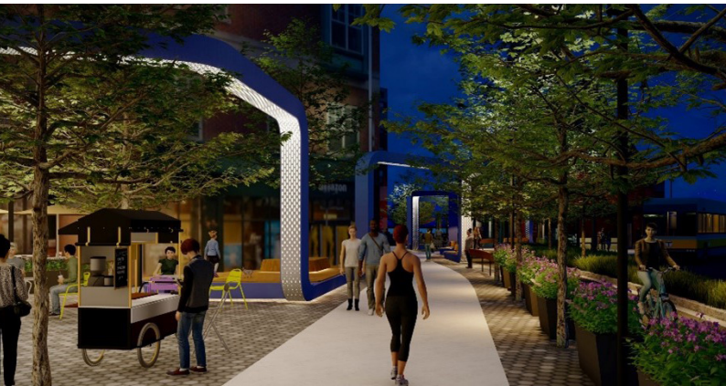
Night view of Carl Barron Plaza. Color shown for the "Ribbon" is a placeholder, pending artist's final design.