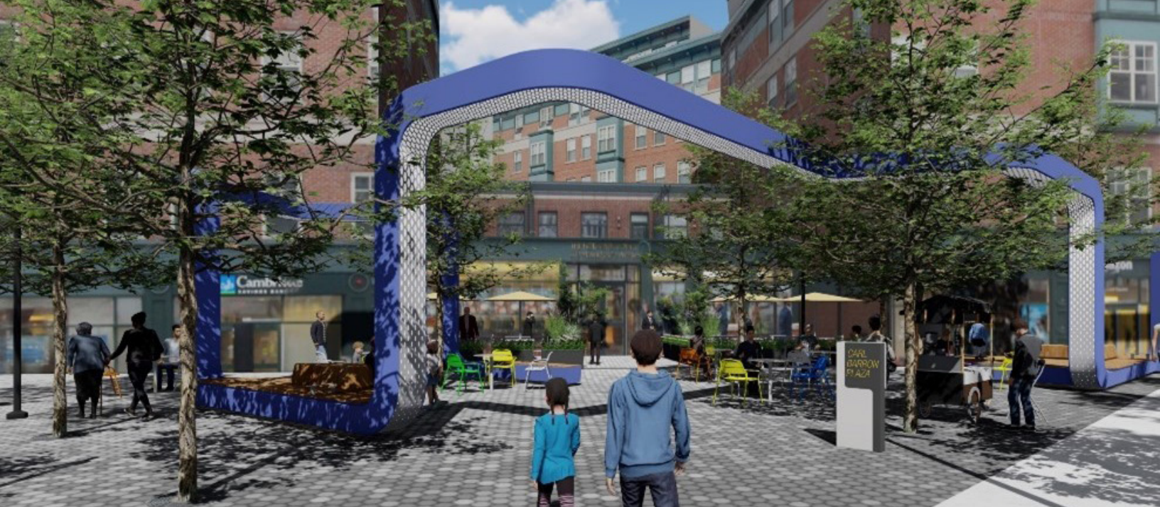
Future Carl Barron Plaza viewed from Mass Ave/River St corner. Color shown for the "Ribbon" is a placeholder, pending artist's final design.