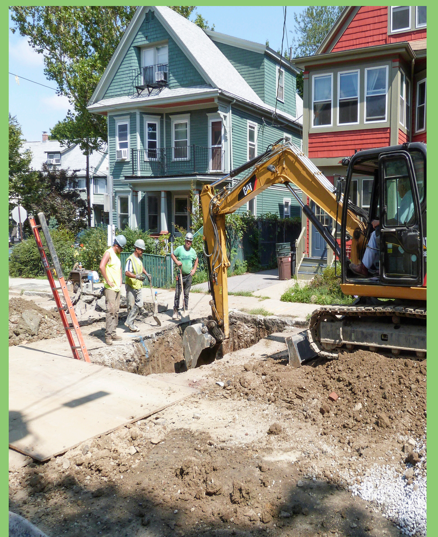
Sewer separation in Cambridge