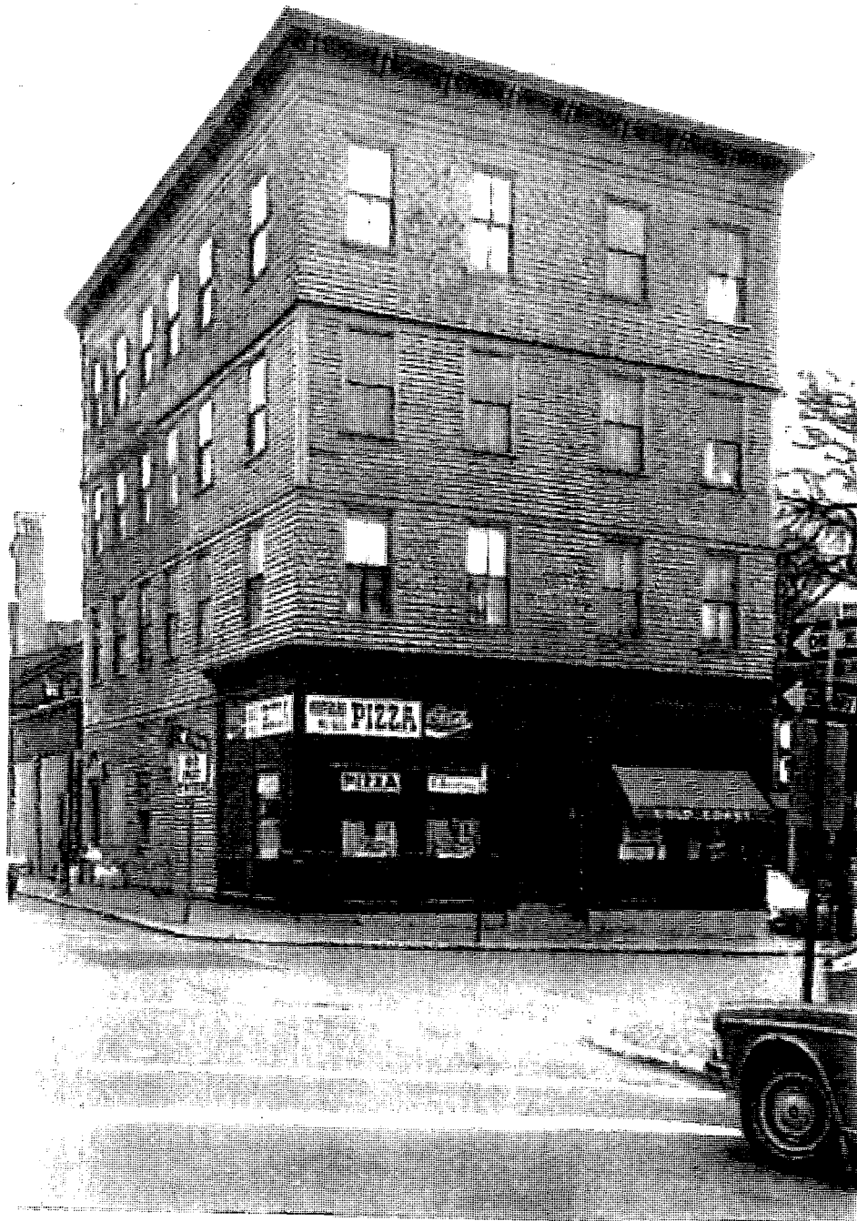
Undated photo – 40 Bow Street

40 Bow Street – this is the second case on the Advisory Committee agenda and will start after the discussion on 98 Winthrop Street has concluded.