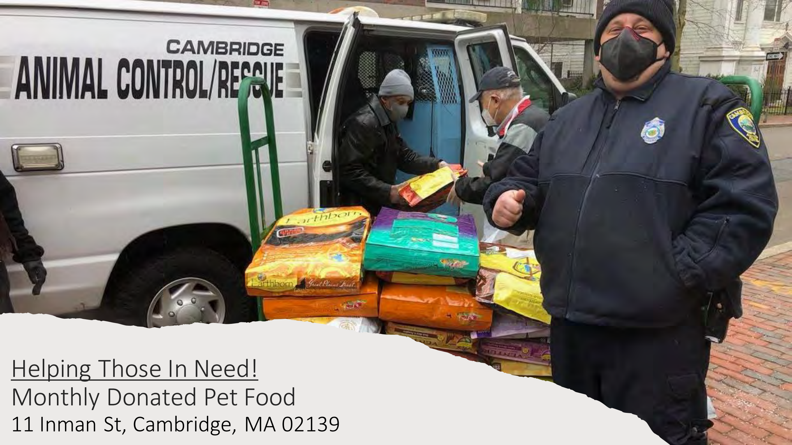
Helping Those In Need! Monthly Donated Pet Food 11 Inman St, Cambridge, MA 02139