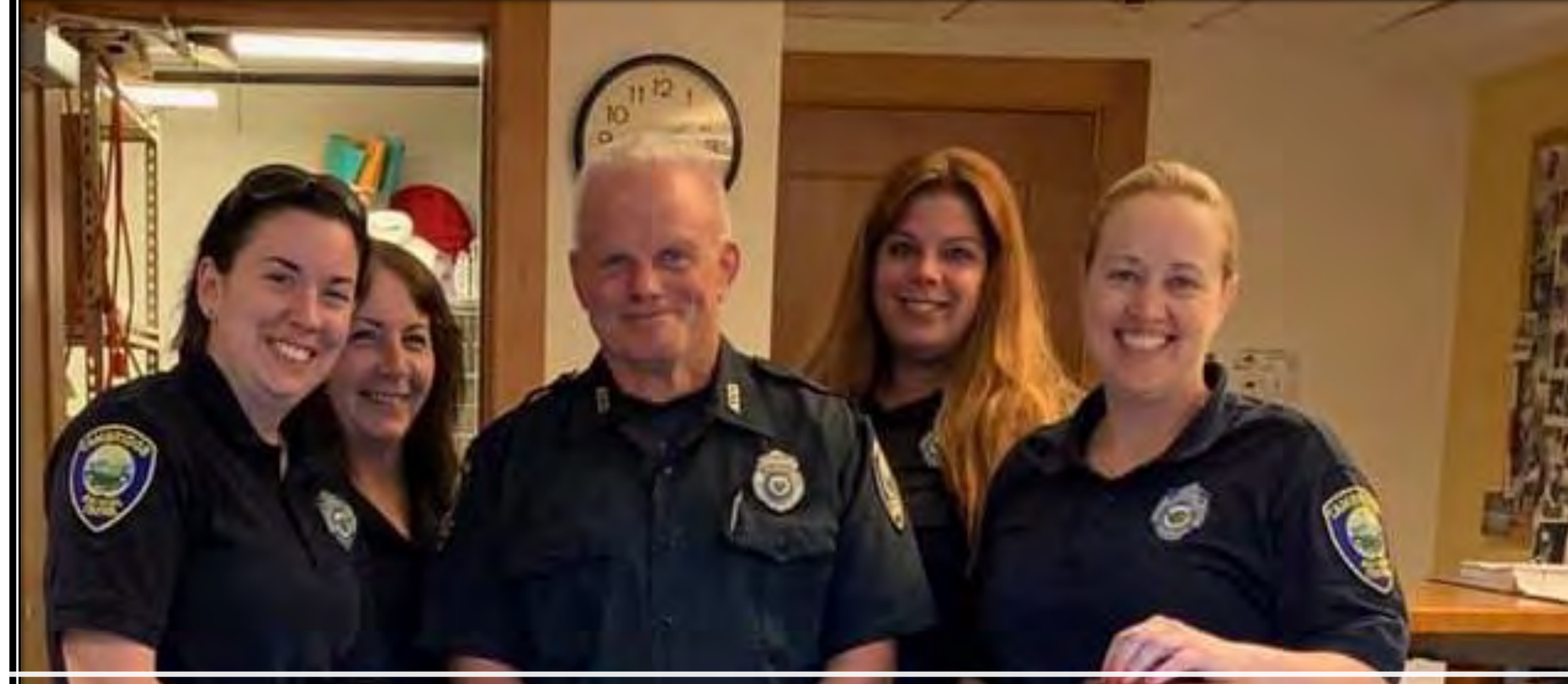
CAMBRIDGE ANIMAL CONTROL