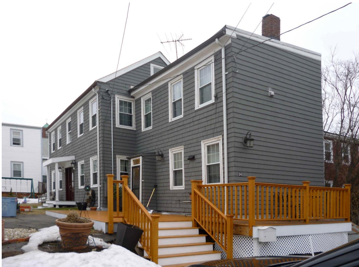
24 Winter Street