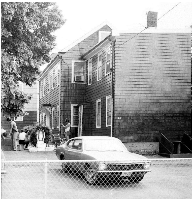
24 Winter Street, 1980

The Leighton house is a late example of a Georgian/Federal workers cottage with a "Type B", side-facing center-hall plan. These houses, which are only one room deep and have only two rooms per floor, originated in the 18th century and were constructed in East Cambridge from the 1820s until about 1840. Until about 1830 they were built with shallow hip roofs, but after that all were built with gabled roofs. Type B houses have center entrances set in five-bay façades, with the ells almost always placed behind the house and away from the street. Exterior details were very simple, with narrow corner boards, shallow eaves, and no projecting cornices on the gable ends. All of these elements survive on the Leighton house, although the front porch has been added.