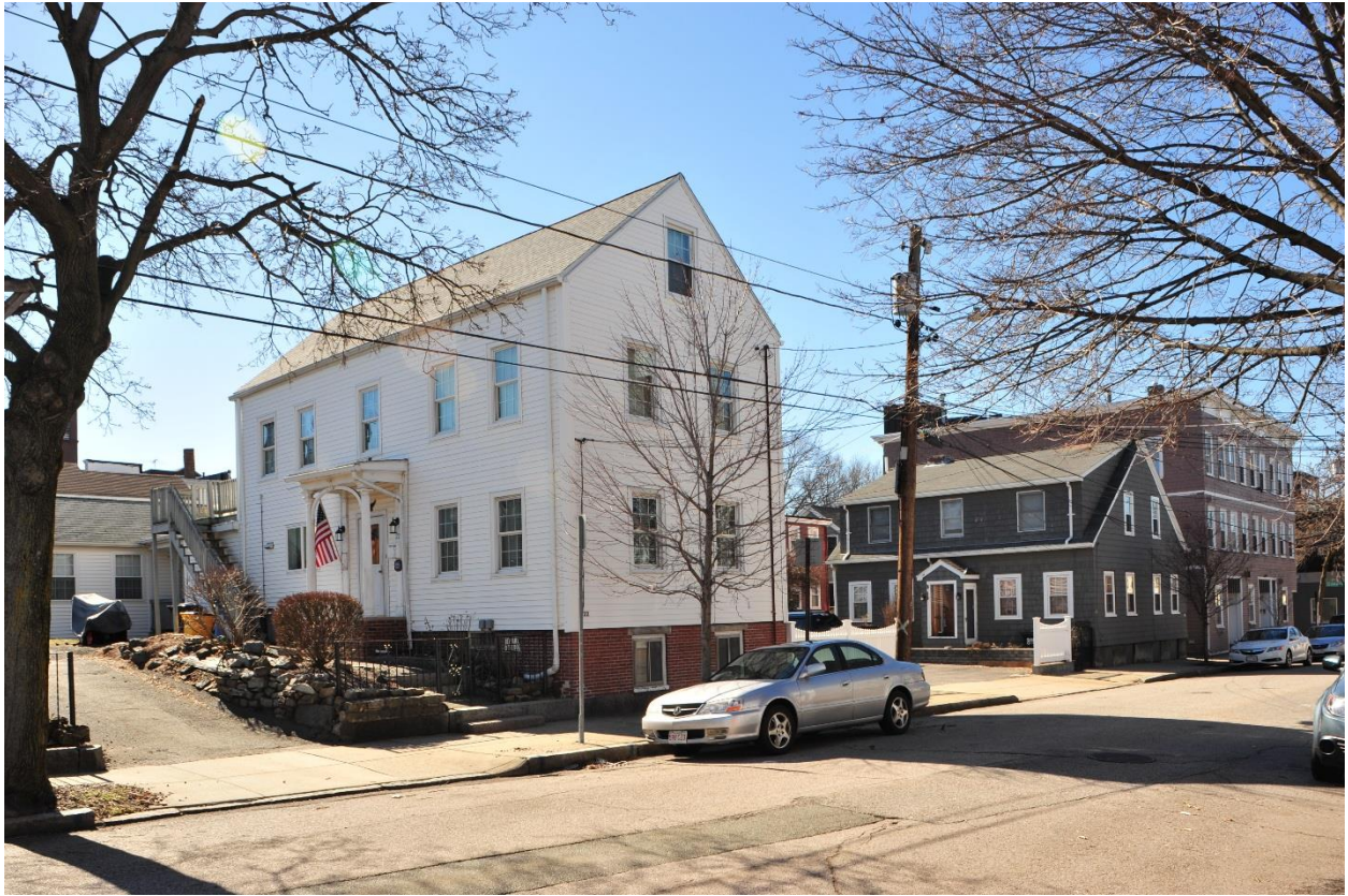
Thomas Leighton house, 22 Winter Street, 2016