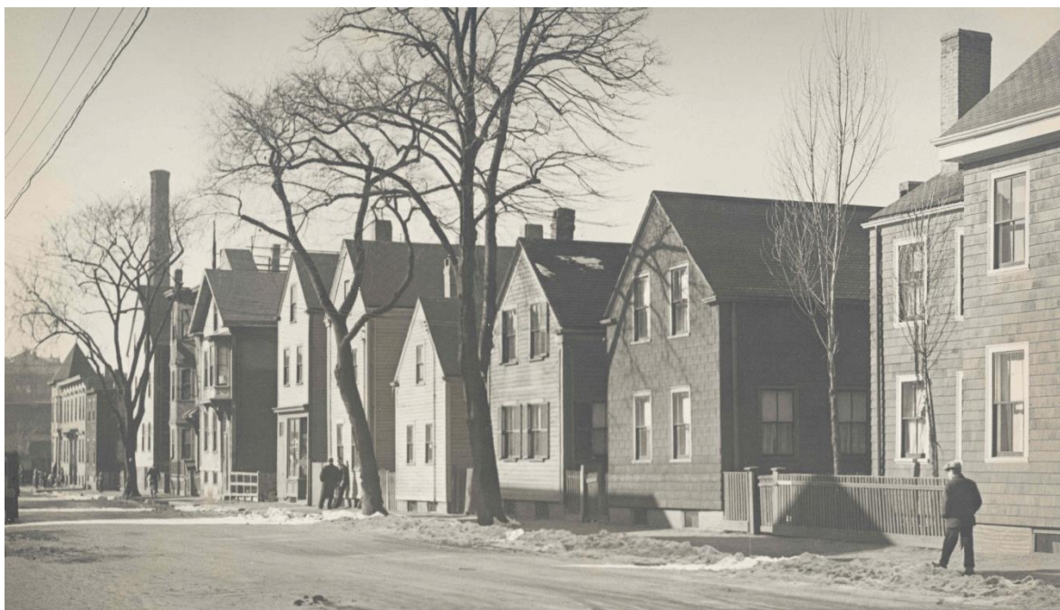
Winter Street west of Sciarappa, ca. 1950