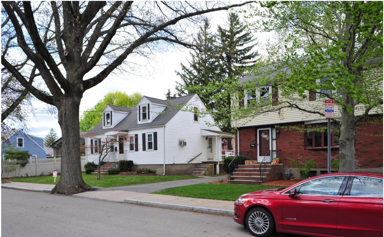
21 Loomis Street (1949) and 25 Loomis Street (1965)