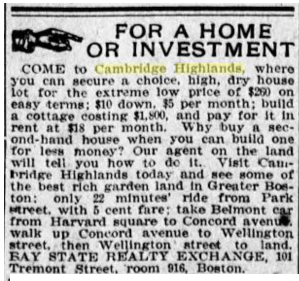
Cambridge Chronicle, Aug. 12, 1916