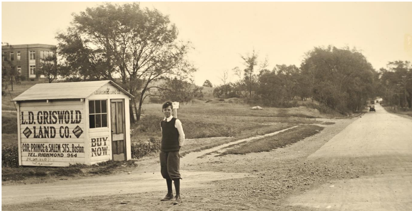
Griswold Land Co. office, Concord Avenue at Griswold Street, 1921

from North Cambridge to construct two-family houses. Public transportation was further improved with bus lines on Blanchard Street in 1934.