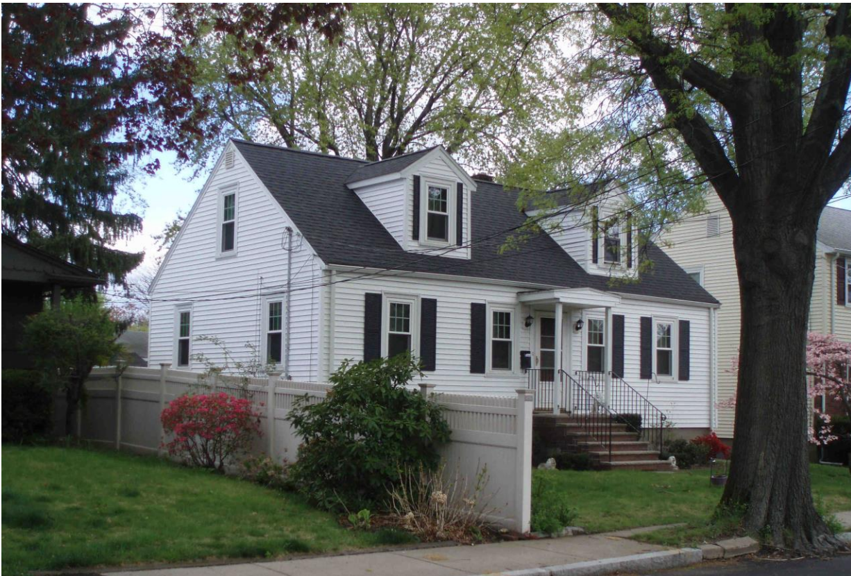
21 Loomis Street