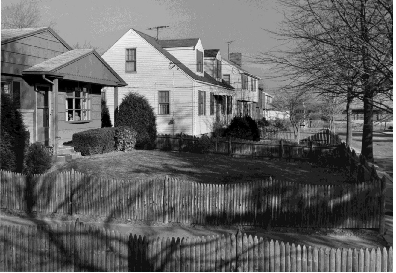
15, 21, and 25 Loomis Street, ca. 1975