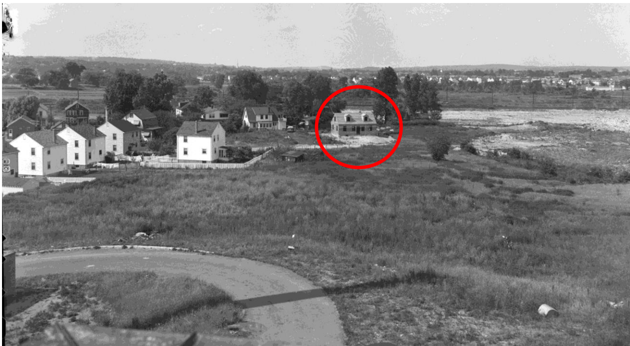
21 Loomis Street under construction, as seen from the roof of the Cambridge Sanatorium, 1949

The first wave of construction began soon after the war, when returning veterans took advantage of federally-insured mortgages to erect single-family houses on consolidated lots. In 1948 John P. Mearn and his wife Ruth purchased five of the old Griswold lots and consolidated them into one 10,305 sf parcel, where in the spring of 1949 they broke ground on the present house at 21 Loomis Street that the assessors valued at $6,000 (plus $500 for the land). This is now the second oldest house on the street