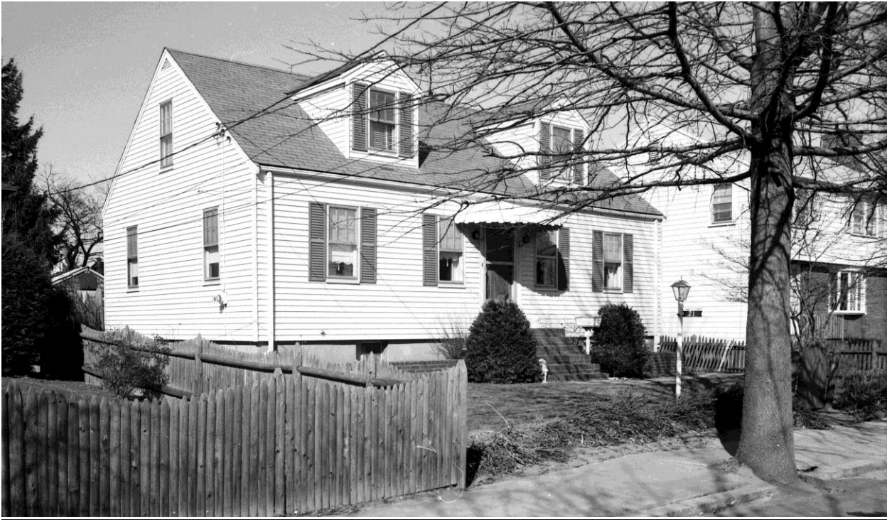
21 Loomis Street