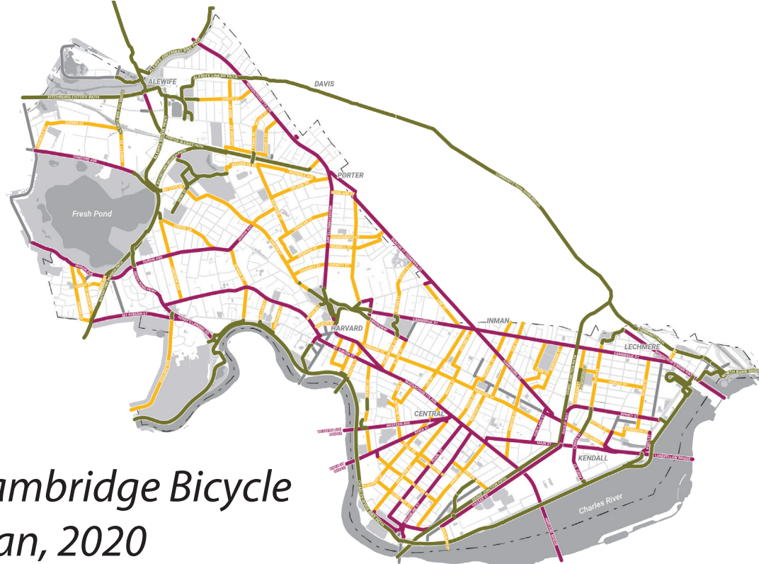
Cambridge Bicycle Plan, 2020