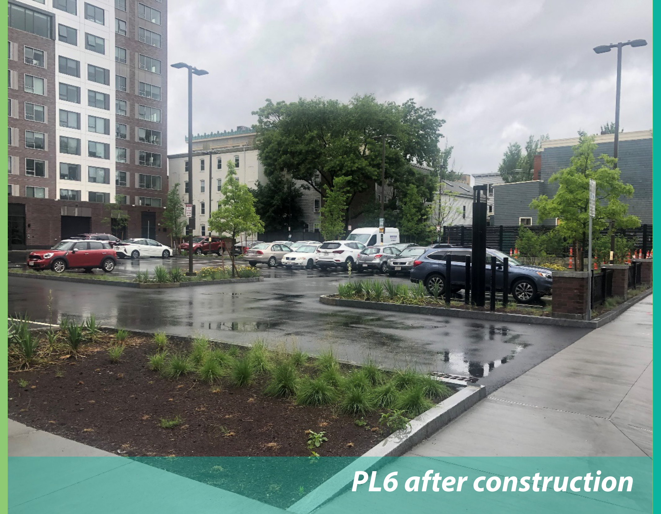
PL6 after construction

In 2020, the City completed an underground stormwater tank and pump station at the City's Parking Lot 6 (PL6).