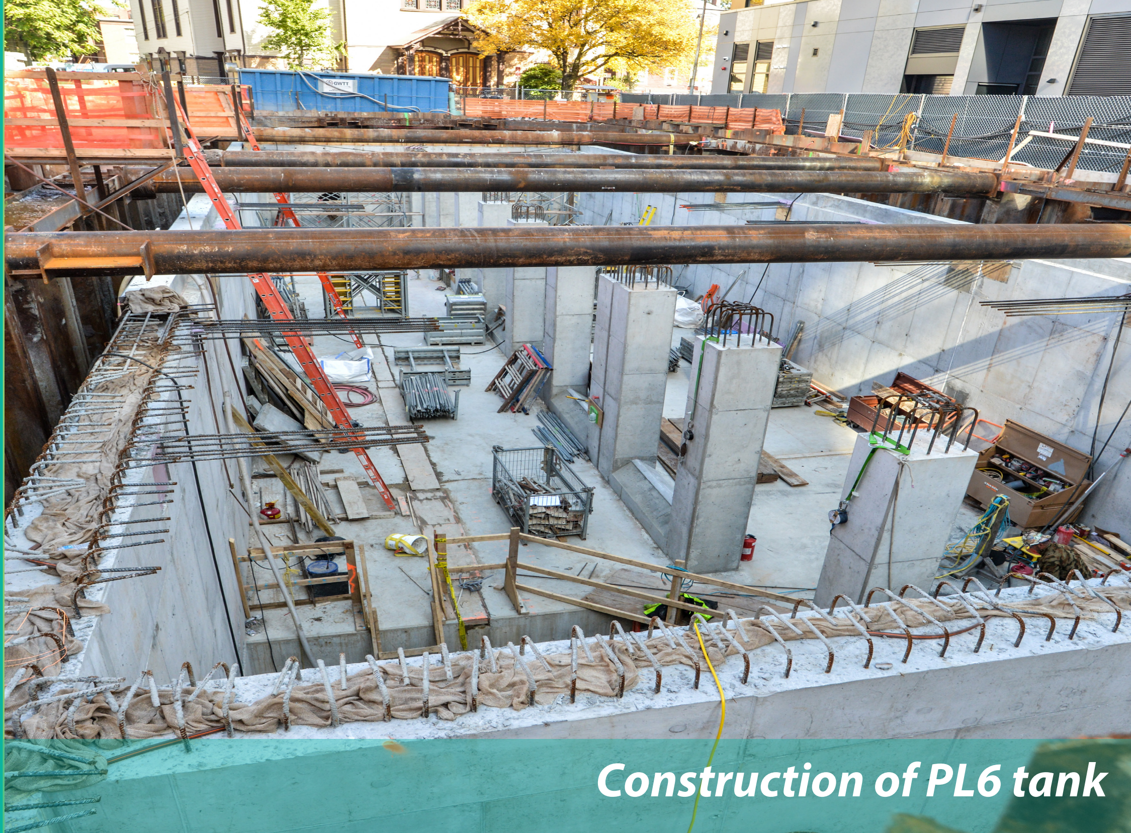
Construction of PL6 tank