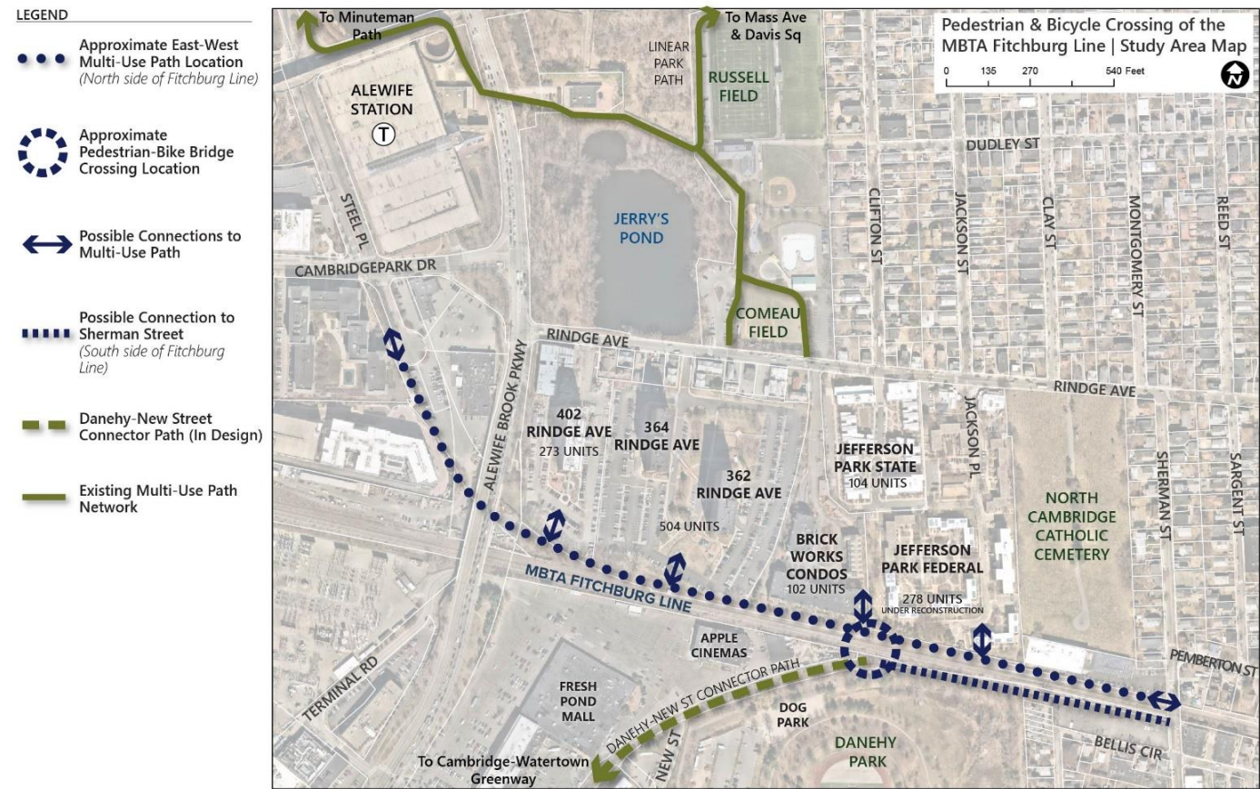
City of Cambridge | Community Development Department | February 2024