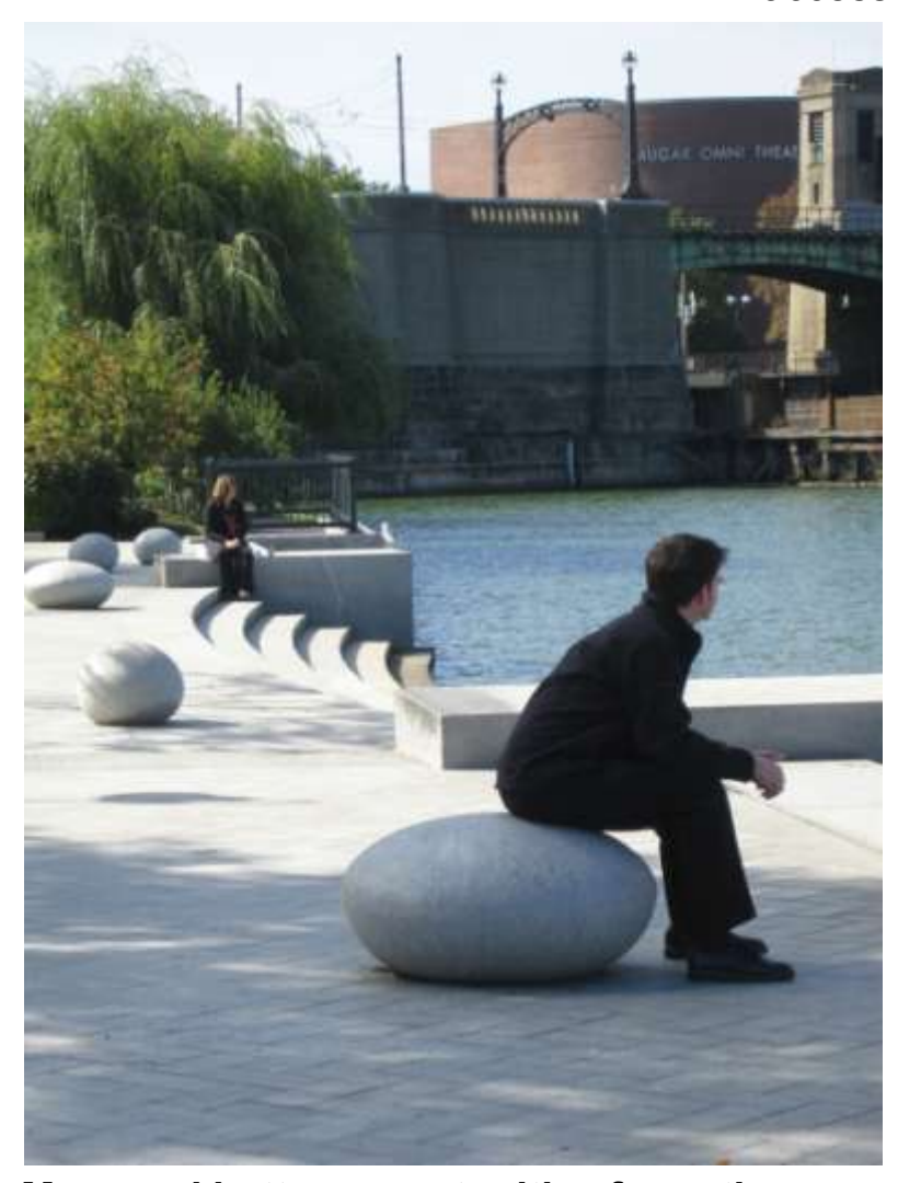
More and better opportunities for active and passive recreation: linear spaces and parks that form nodes of activity

Enhanced Connections: identifying and strengthening the streets, sidewalks, pathways that enable people to access the riverfront