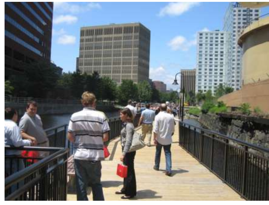
Focus on opportunities for positive change via site and building redevelopment