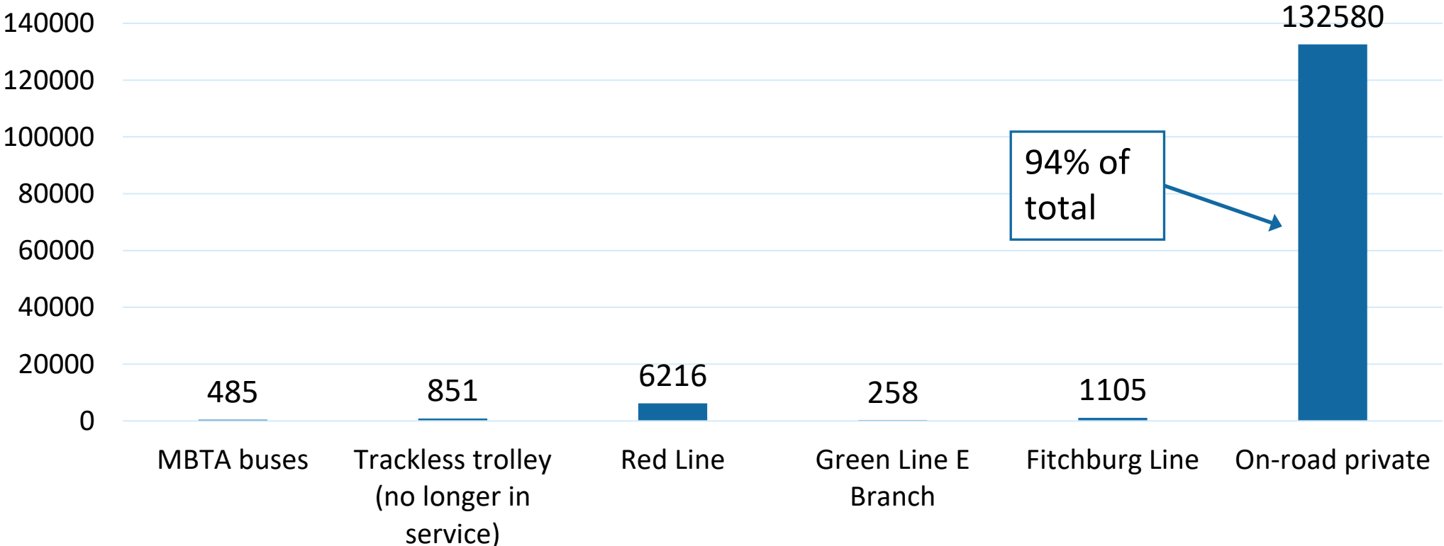
Estimated greenhouse gas emissions from transportation in Cambridge