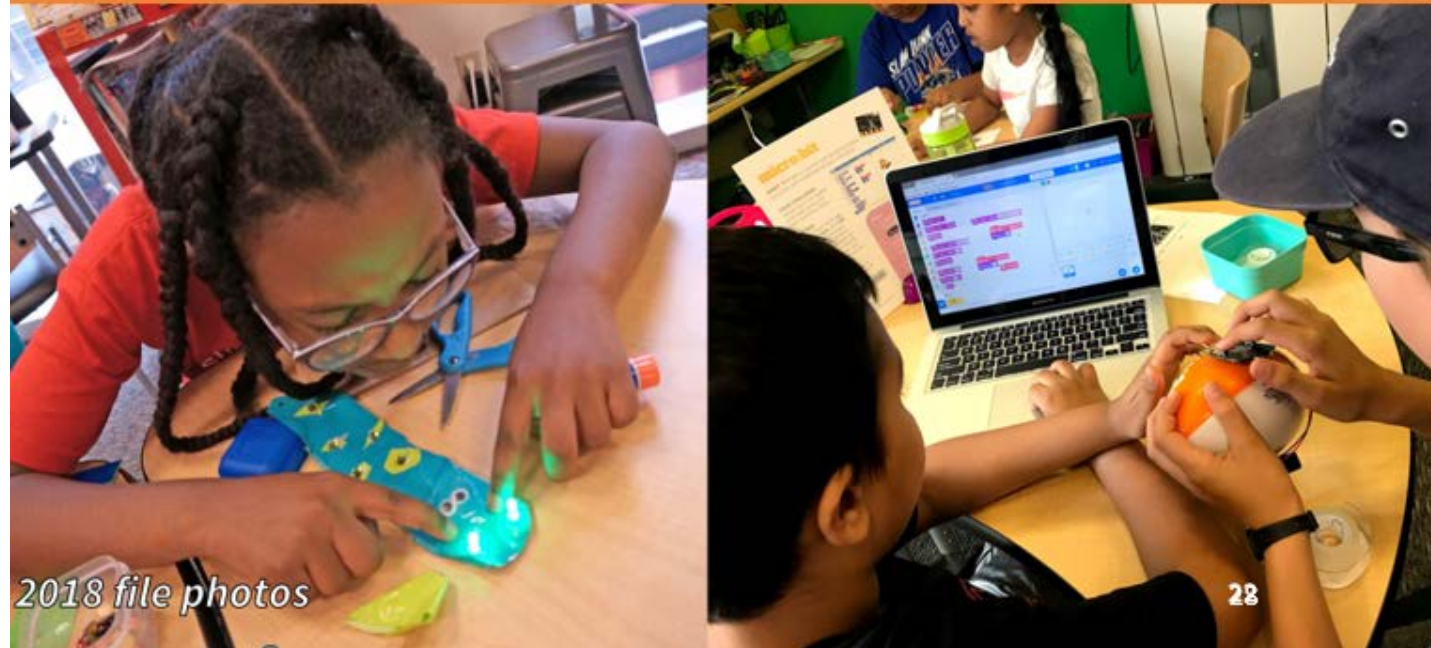
2018 file photos