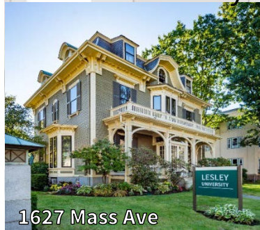
1627 Mass Ave