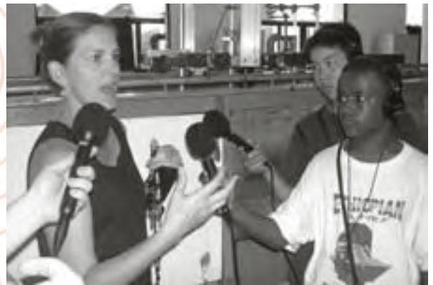
Terrascope Youth Radio participants conduct a field interview.