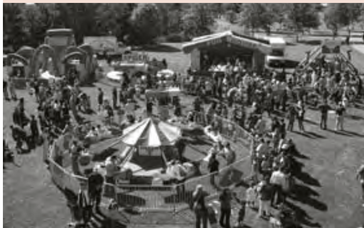
Hundreds of people enjoyed children's amusement rides, arts and crafts, roving performers and entertainment at Danehy Park Family Day in September.