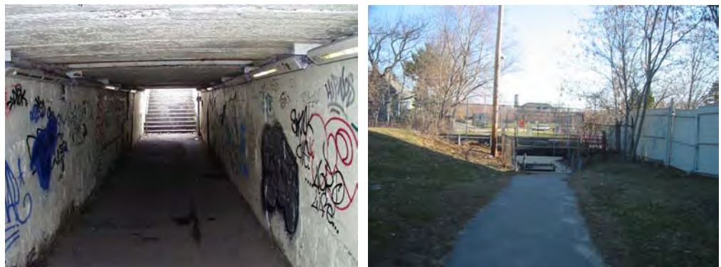
Figure 2: Preconstruction Photos

Excluding the Yerxa Road underpass, the closest locations for pedestrians to cross the rail line are at Walden Street (1260' to the east) and Sherman Street (970' to the west). Both of these streets are high volume streets that are not ideal for pedestrians, especially younger school age children who may be traveling alone. Using the underpass, a child living at Walden Square going to school at the Fitzgerald Elementary School has a 1/5 of a mile commute on a quiet residential street. Without the underpass, this child has over a 1/2 mile commute that includes walking along Sherman Street.