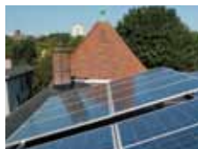
It's the Cambridge Year of Solar! Page 6