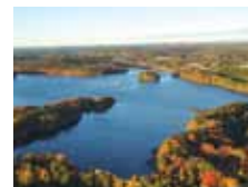
Tapping into Cambridge Water Page 7