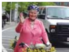
Cambridge Commits to Vision Zero Page 3